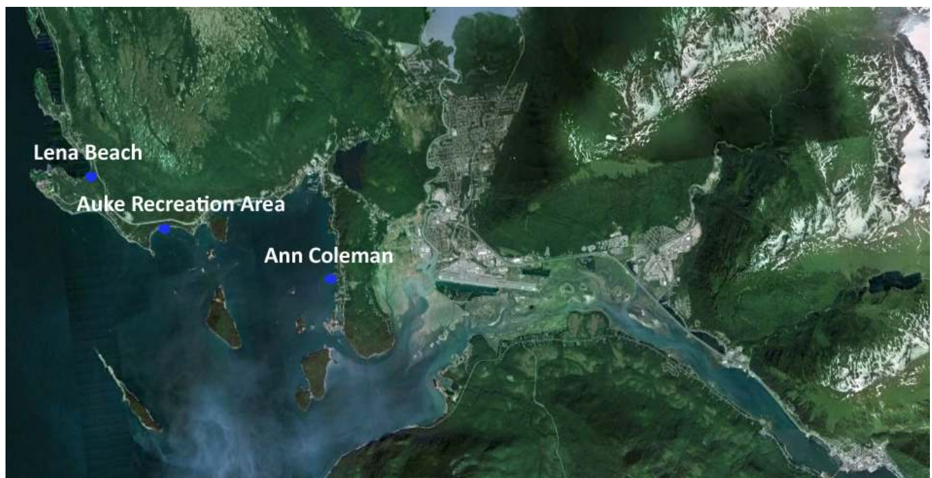
Figure 1: Juneau BEACH Sampling Sites (based on Google Earth created by JWP)