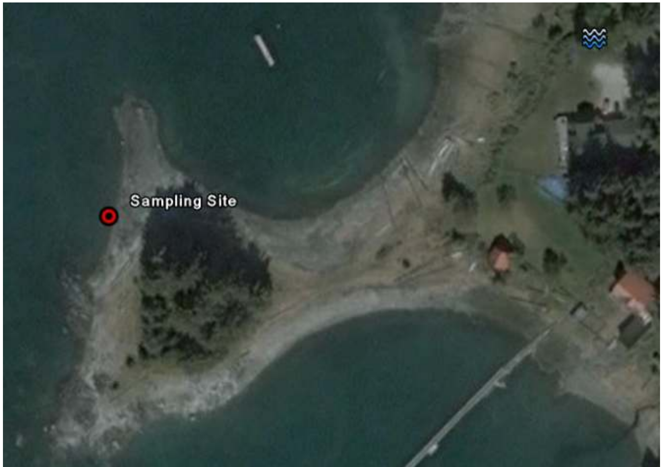
Figure 4: Map of Ann Coleman Street Beach.

This beach is located off of Fritz Cove Road, about 12 miles northwest of Juneau. It provides access to the Ann Coleman Wall Underwater Trail, a popular scuba diving route. Anglers often fish from the shore or small boats nearby. The beach is 1.75 miles southeast from the Auke Bay Wastewater Treatment Facility and the Auke Bay Harbor. This location is resulting in relatively heavy small boat traffic.