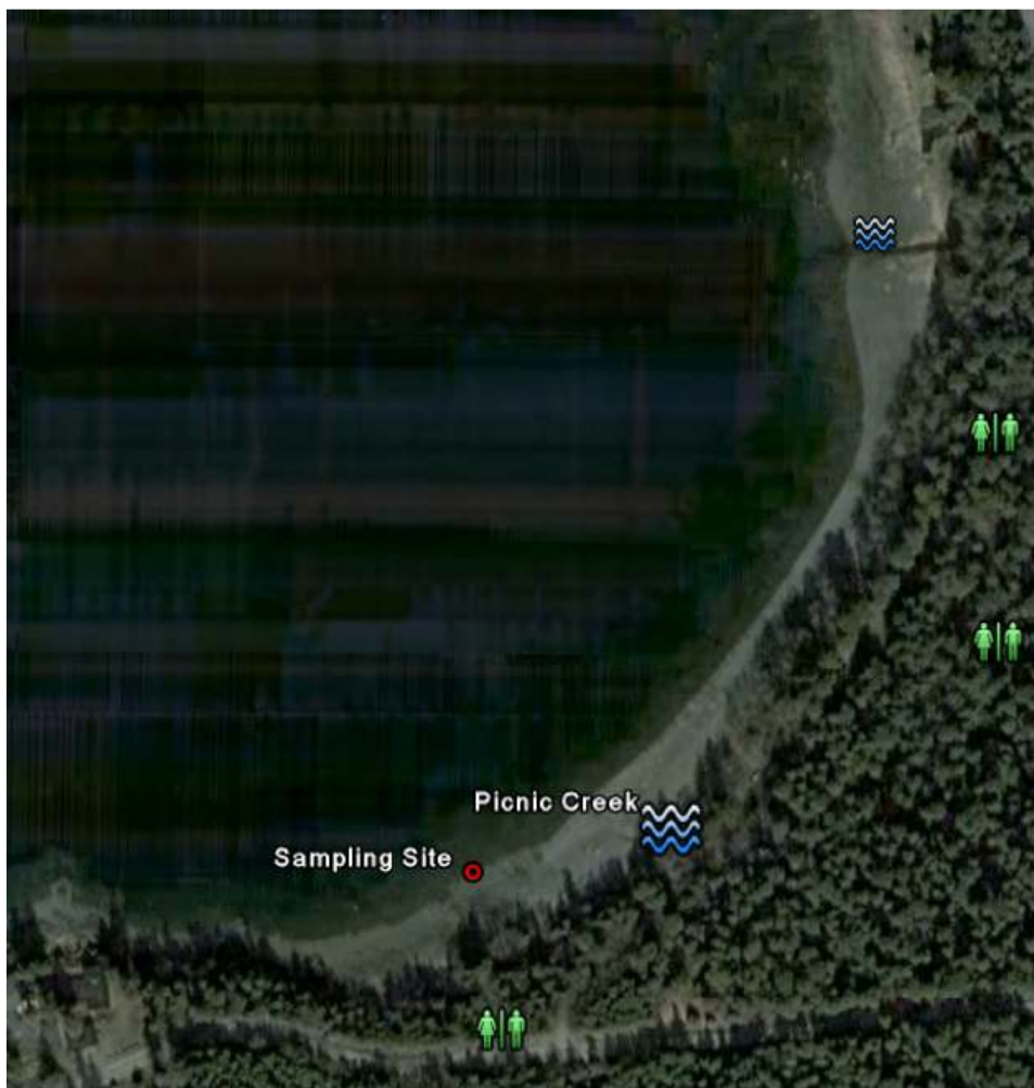
Figure 2: Map of Lena Cove Beach.

This U.S. Forest Service Recreational Area is located about 16 miles northwest of Juneau. Recent residential development has increased public usage and the density of septic systems at this beach. Septic drain fields were designed to handle human waste effectively, but there is still potential for development to impact near-shore water quality. The beach is popular for hiking, dog-walking, picnicking, and swimming and is serviced with a picnic area and pit toilets. Picnic Creek runs down the beach, after flowing through a fish passage, attracting wildlife when salmon return annually to the creek to spawn.