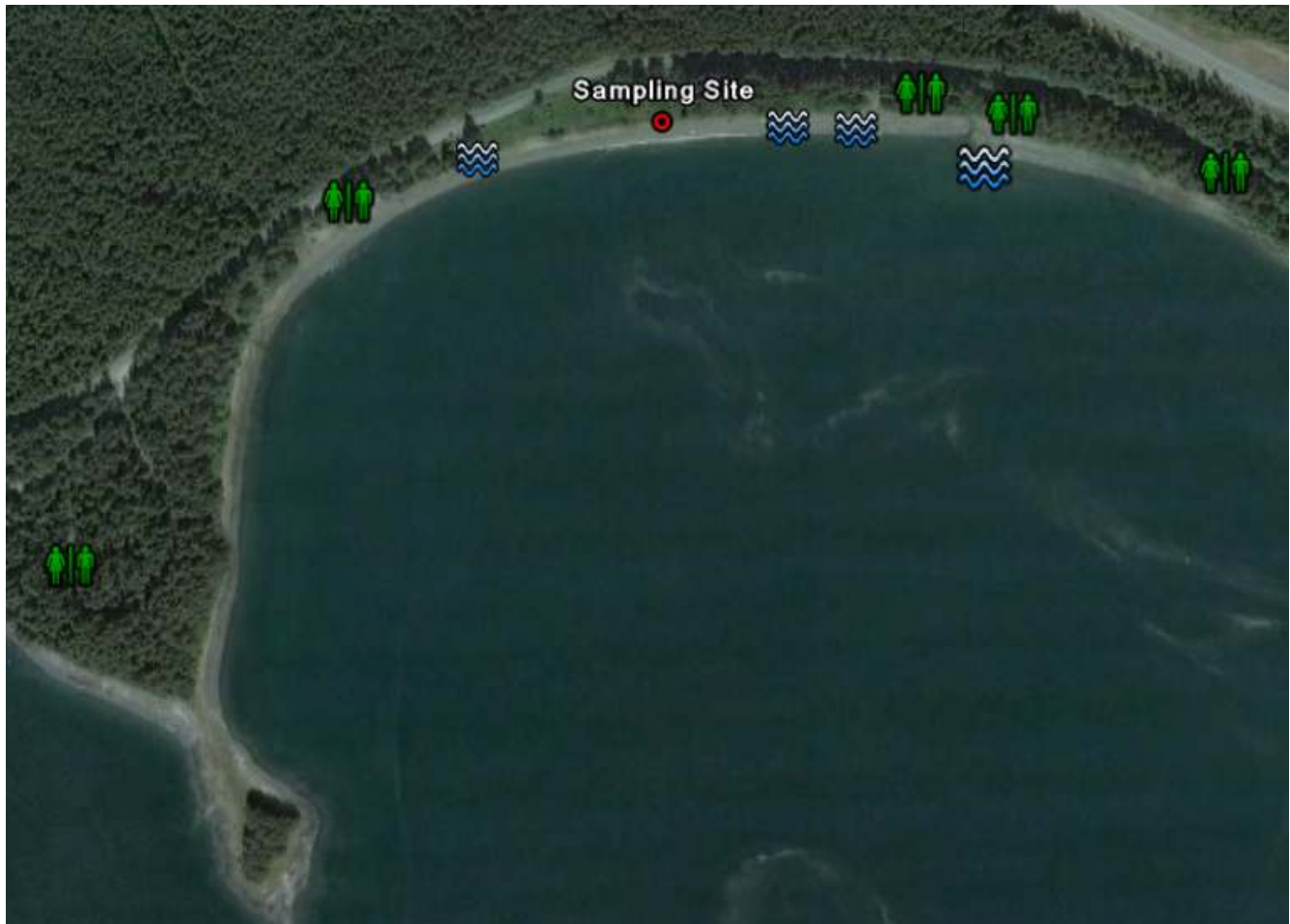
Figure 3: Map of Auke Recreation Area Beach.

A USFS Recreational Area located 14 miles northwest of Juneau, just past the ferry terminal. Auke Recreation Area is one of the most popular beaches around Juneau and is equipped with several picnic shelters, fire rings, and pit toilet facilities. The beach is adjacent to the Auke Village USFS campground. A residential development serviced by septic systems borders the southern end of the beach. The Auke Bay Wastewater Treatment Facility and Auke Bay Harbor lie 2.5 miles to the west.