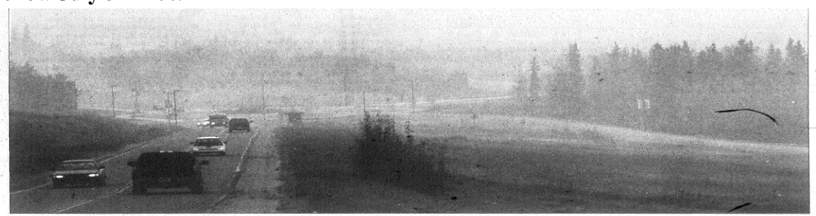
Smoke blankets Fairbanks as traffic moves along Tanana Loop on the University of Alaska Fairbanks campus on Thursday. The thick smoke pouring in from wildfires has caused the Fairbanks North Star Borough to issue an air quality advisory for the area.