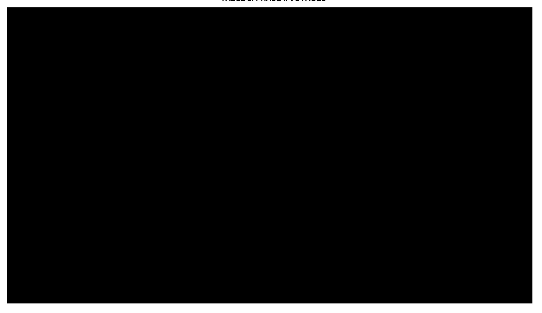
TABLE 2. PHASE II VOYAGES