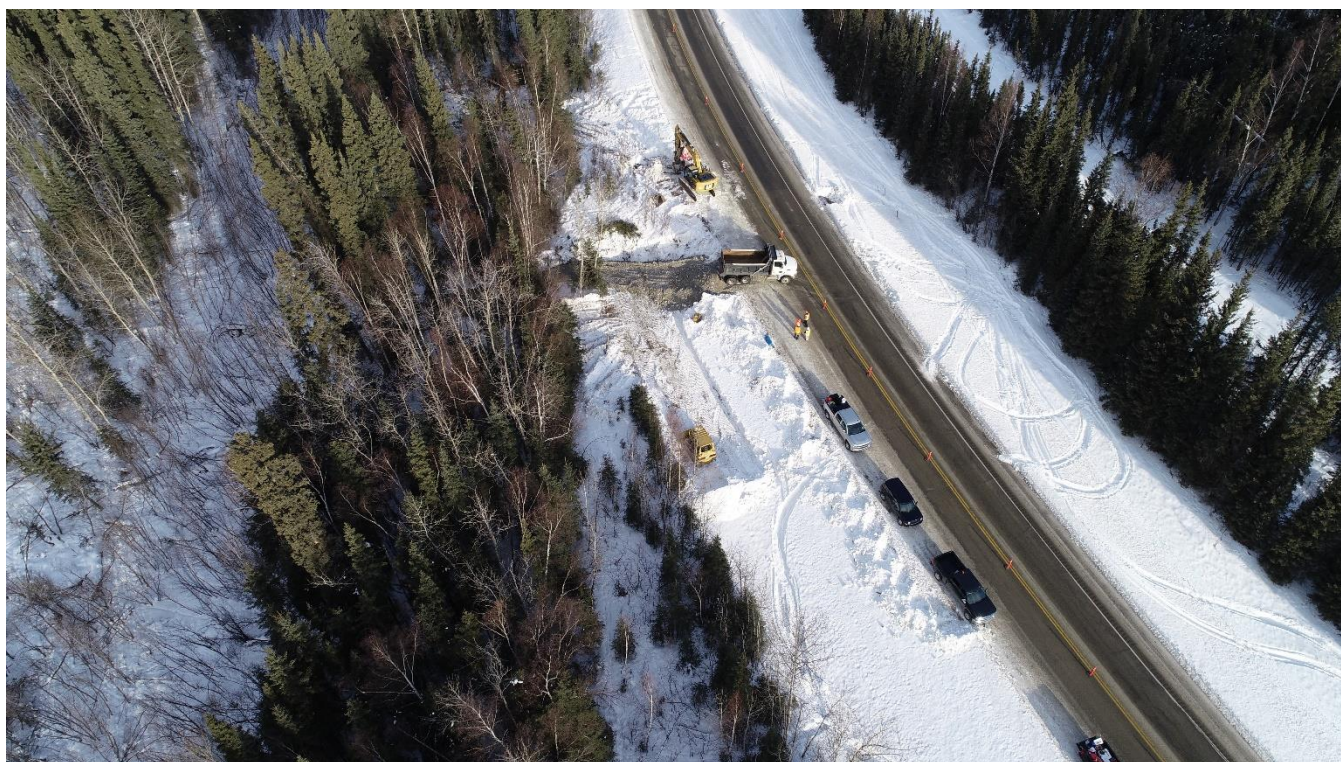
Aerial view of spill site on March 12 2018, facing northeast