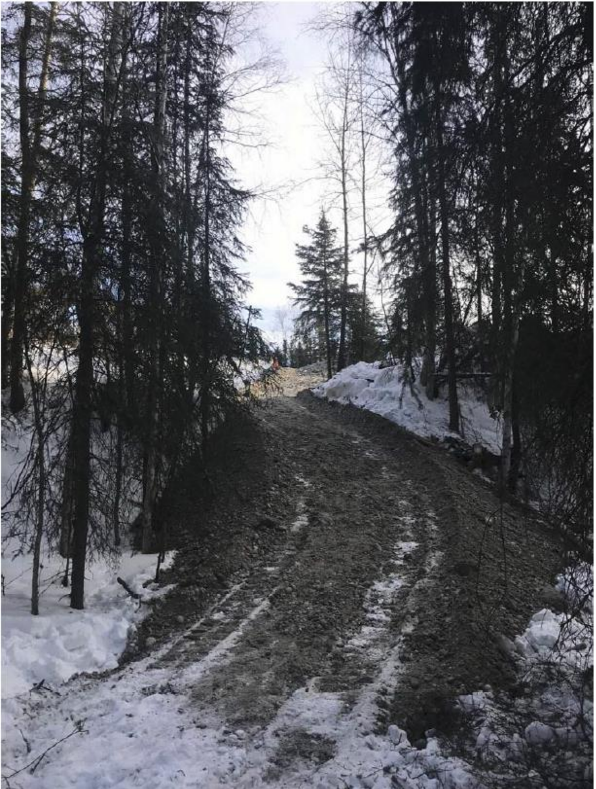
Ramp constructed to access lower spill area