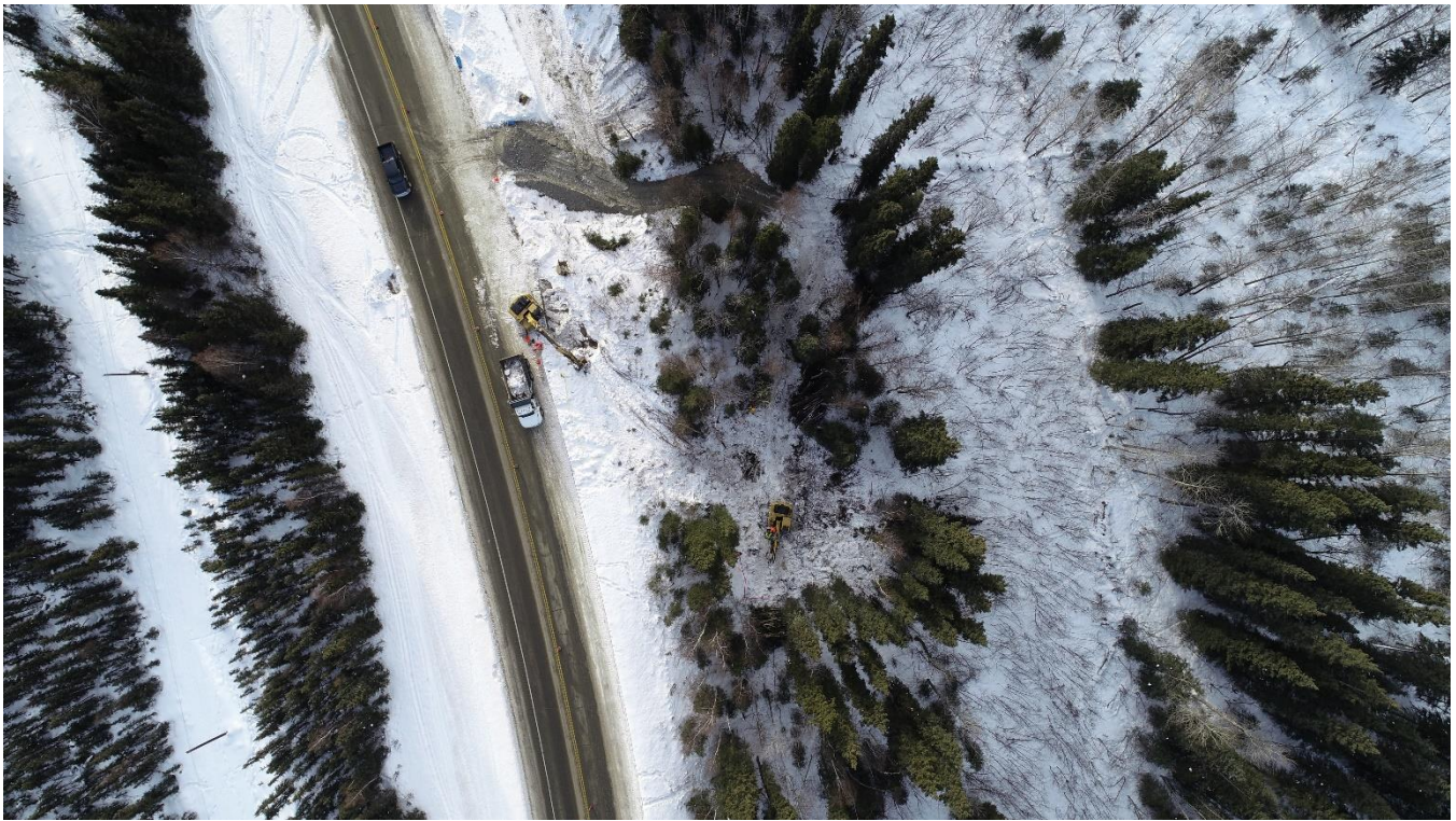
Aerial view of spill site on March 12 2018, facing down