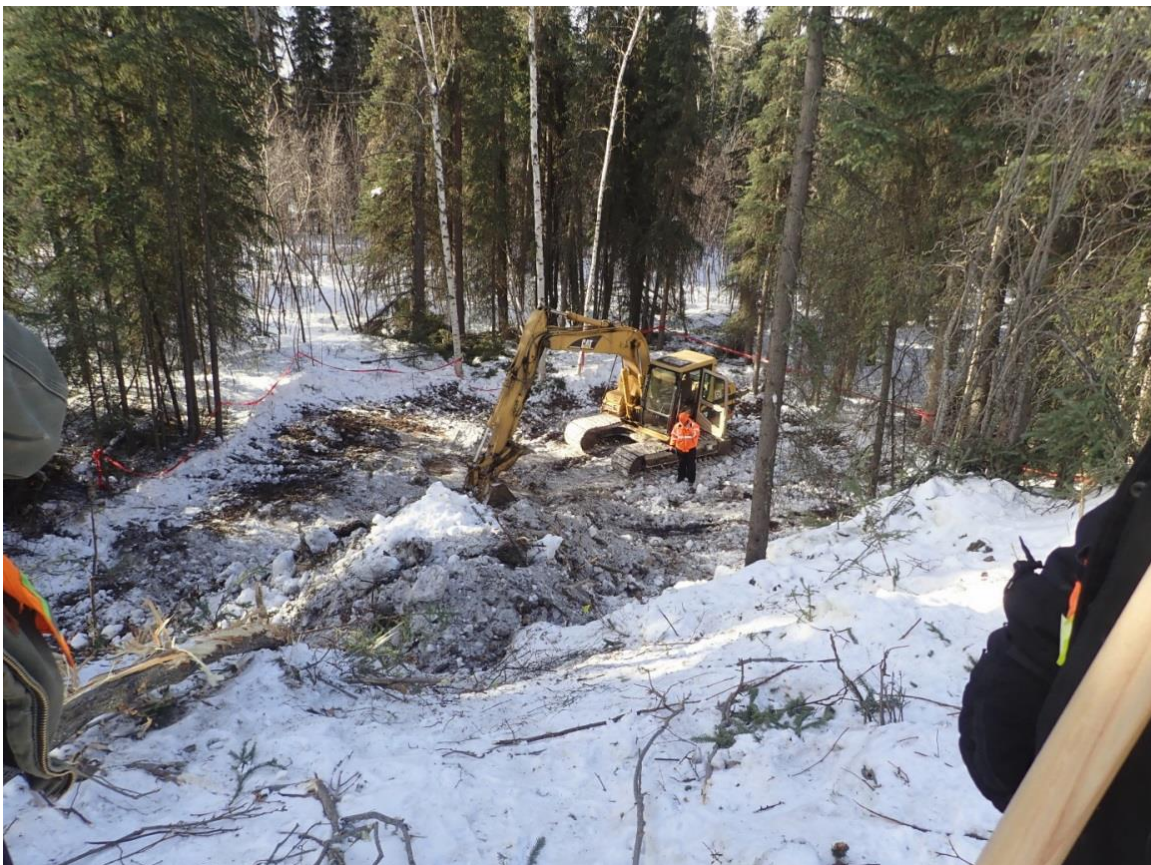
Tree removal at the lower spill area, March 12 2018