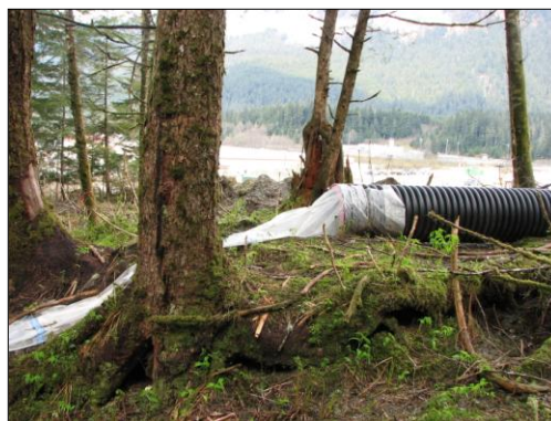
Figure 9. The temporary water diversion conduit that transports stormwater from the hill behind Home Depot into Vanderbilt Creek. June 2007

There are several conveyances of concern: a drainage pipe conveying stormwater from the located along Glacier Highway accumulating sludge, a grate located on Short Street, and the conveyance diverting runoff from the HD site. Improvements on some of these conveyances are listed as separate actions.