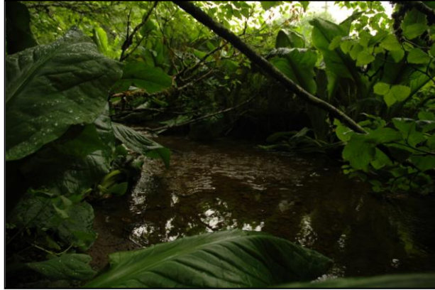
Figure 1. Vanderbilt Creek at the entrance to the Lemon Creek Trail off of Glacier Highway.

Vanderbilt Creek is a small creek located on the eastern side of Lemon Creek Valley, about 5 miles northwest of downtown Juneau, Alaska. The watershed consists of approximately 93 hectares of land (Rinella et al. 2005) and is bound by Blackerby Ridge to the east; residential and commercial areas to the north; with commercial areas continuing to the west; Channel Landfill to the southwest; and the intersection of Vanderbilt Hill Road and Egan Drive to the south (Figure 3). Vanderbilt Creek is approximately one mile (2 km) long, with major tributaries flowing from Blackerby Ridge.