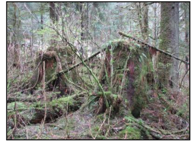
Figure 4. Decaying tree stumps from logging along Lemon Creek Trail.

Designated protected uses for Vanderbilt Creek as identified in Alaska's Water Quality Standard Regulations (18 ACC 70) include drinking water, industrial and aquaculture purposes; contact and secondary recreation; growth and propagation of aquatic life and wildlife.