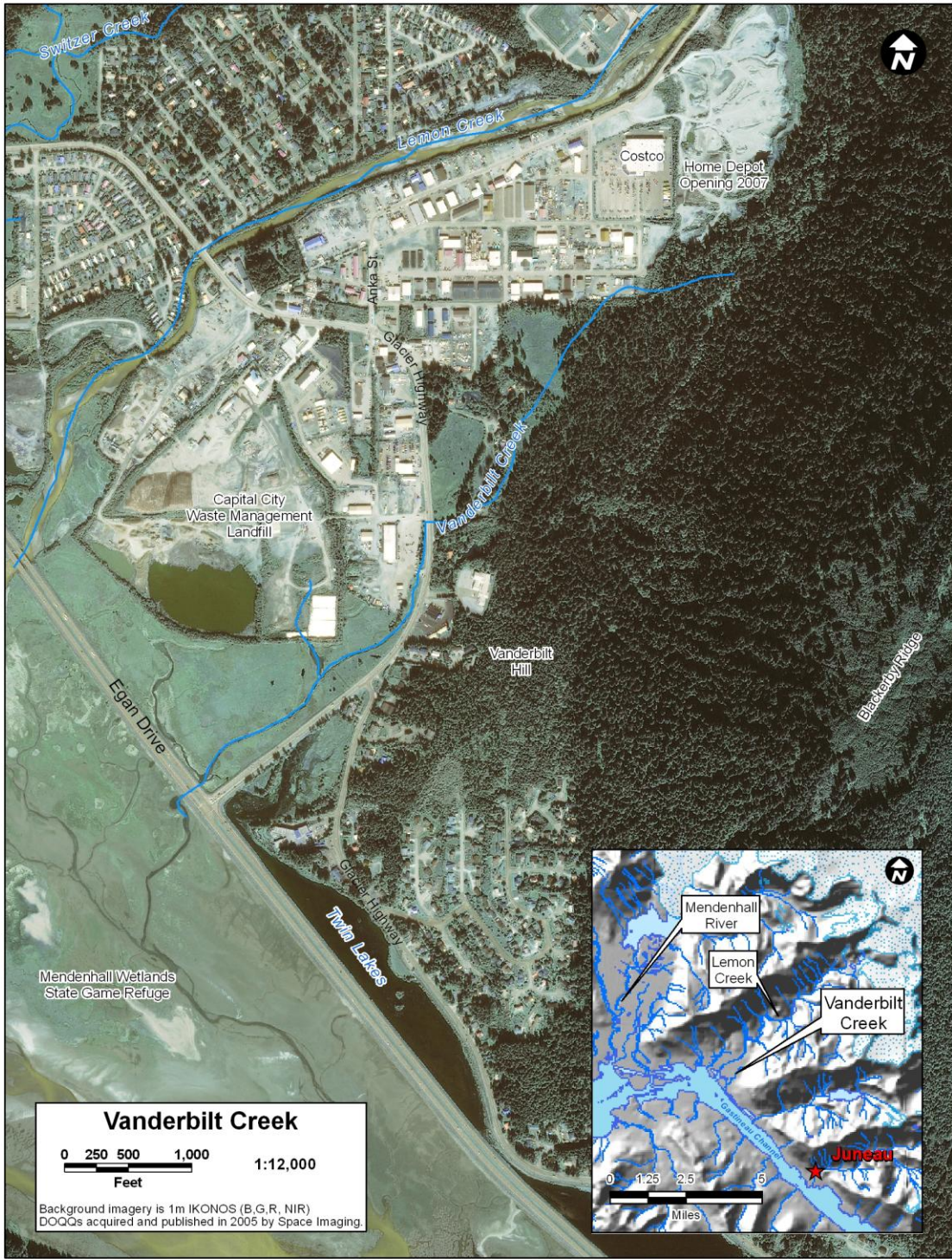
Figure 3. Map of Vanderbilt Creek. Stream layer is from the Alaska Department of Fish and Games' Anadromous Waters Catalog. Cartography by Deb Spicer, Juneau Watershed Partnership, May 2007.