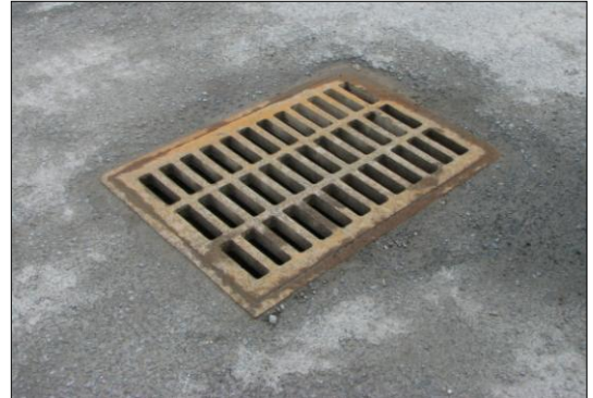
Figure 5. A storm drain on Short Street that transports sediment directly into Vanderbilt Creek.

Garbage and other debris can reduce aesthetics, introduce contaminants, impede fish passage and degrade habitat. Sources of debris in Vanderbilt Creek include littering, sediment/debris wedges from naturally occurring landslides, and potentially windblown, loose debris from the nearby landfill or other areas.