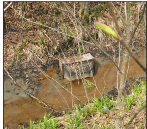
Figure 6. A TV in a ditch that drains from Charles Way to Vanderbilt Creek.