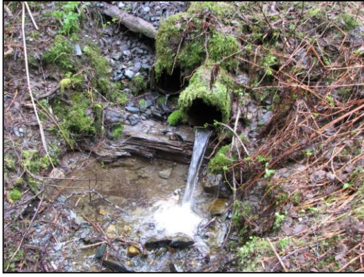
Figure 11. One of several undersized, perched culverts on Vanderbilt Creek along the Lemon Creek Trail

Though fish have not been seen using many of these tributaries (Pat Quigley, personal communication, May 13, 2007), Frenette suspects that coho have historically used the waters and will do so again once the habitat is reconnected. Replacing these culverts with bridges would allow each tributary to flow naturally across the landscape, reconnecting the habitat. Frenette says proper stream crossings would also prevent road washout along the Lemon Creek Trail. Again, these culverts can be assessed using the US Forest Service' (USFS) "FishXing" software and alternatives for replacement structures can be considered.