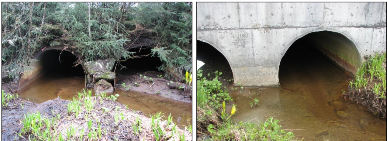
Figure 10. The inlet (left) and outlet (right) of the Glacier Highway culverts. As shown, one of the culverts has failed due to sediment build up.

The pair of culverts that direct the mainstem of Vanderbilt Creek under Glacier Highway have several problems that make them a priority for replacement. Both culverts are closed-bottom which could affect the presence of natural substrate and hydrologic conditions, and there is visible rotting of the culvert material in one of the culverts.