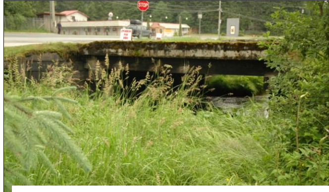
Figure 12. One of the creosote bridges crossing Vanderbilt Creek.

Two creosote bridges cross Vanderbilt Creek on Glacier Highway, providing access to Grant's Plaza/Western Auto and Jerry's Meats. There is also an additional creosote abutment that is currently not being used as a bridge.