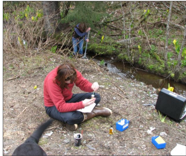
Figure 8. JWP volunteers conducting a rapid bioassessment on Vanderbilt Creek.

A rapid bio-assessment of Vanderbilt Creek was completed by the University of Alaska Anchorage Environment and Natural Resources Institute (ENRI) in May of 2003 (Rinella et al. 2005). A rapid bio-assessment provides a "snapshot" of conditions in the creek using macroinvertebrates as bio-indicators. The parameters measured during this study included conductivity, pH, dissolved oxygen, temperature, and discharge; a visual assessment of riparian and streambed habitat; and an assessment of the macroinvertebrate assemblage. Data was collected along a 100-meter stretch of creek where Discovery Alaska's office used to be located. Data from ENRI (see Appendix C) continues to suggest that Vanderbilt Creek is an impaired waterbody.