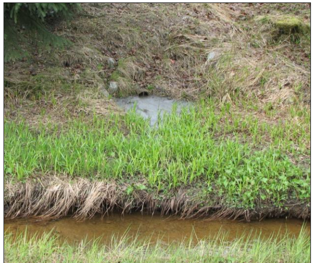
Figure 7. A small drain with a pool of sludge accumulating near Vanderbilt Creek.

Other pollutants of concern not listed in the TMDL include hydrocarbons and landfill leachate. Hydrocarbons are introduced to the creek from oil, gasoline, and other chemicals used for vehicle maintenance and operation. Due to heavy road traffic and large parking areas in the vicinity of Vanderbilt Creek, hydrocarbons are likely pollutants. Leaks, spills, or improper disposal of chemicals containing hydrocarbons could lead to their being washed into the creek with stormwater runoff, but there is no current data for hydrocarbons in Vanderbilt Creek to quantify this.