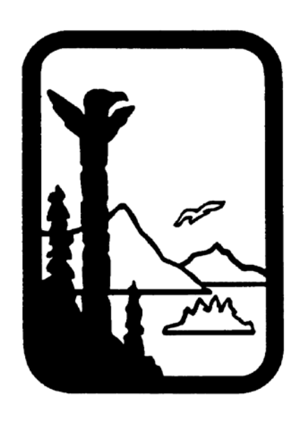
Vol. III: Appendices