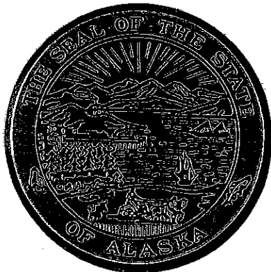
SEAN PARNELL LIEUTENANT GOVERNOR