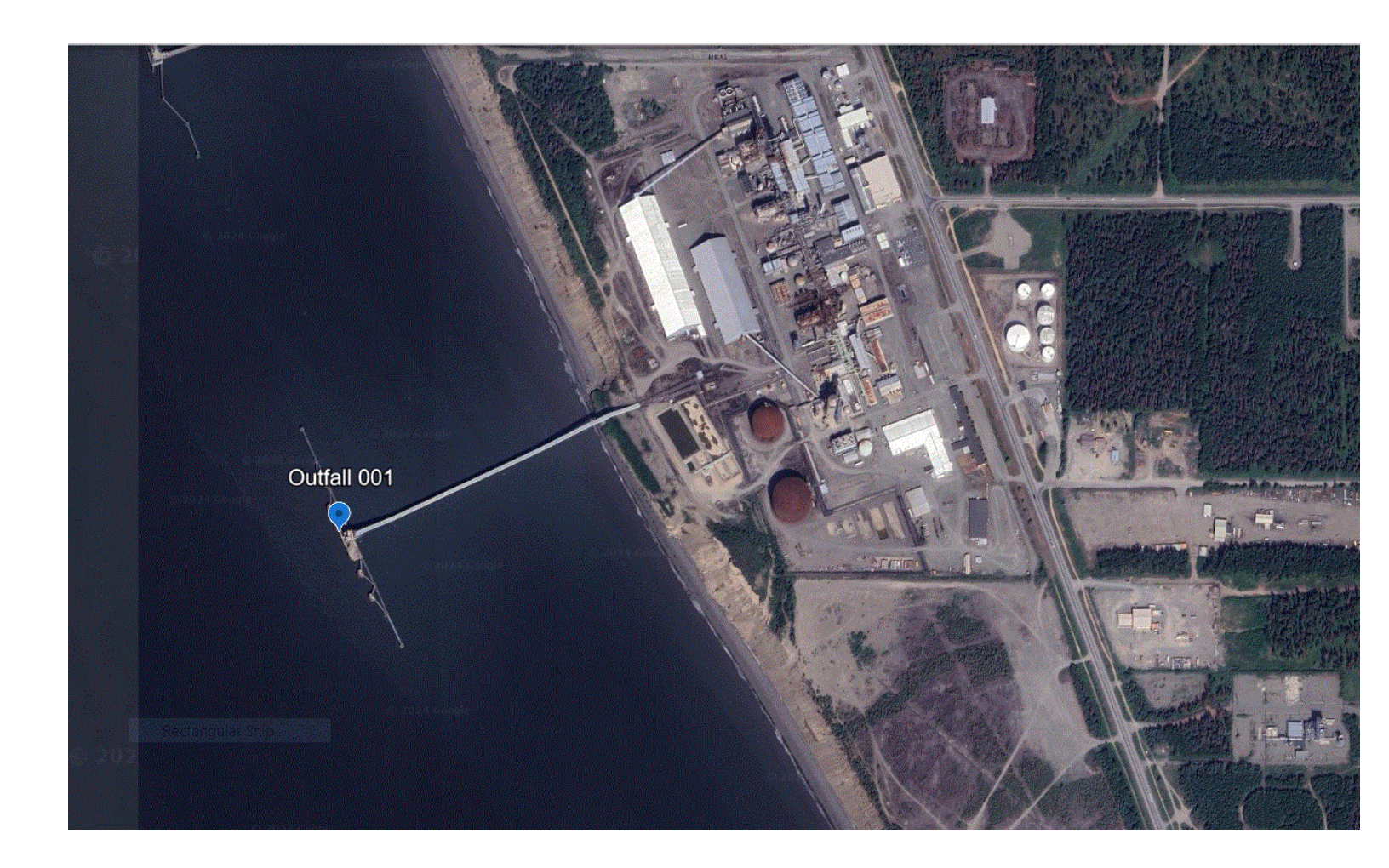
Figure 1: Nutrien Kenai Nitrogen Operations Map