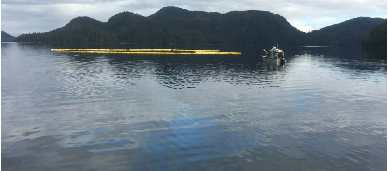
Booming of Tug Powhatan

AGENCY/STAKEHOLDER NOTIFICATION LIST: This situation report was distributed to the agencies listed on the standard distribution list, which includes the governor's office, State Emergency Operations Center, U.S. Department of the Interior, National Marine Fisheries Service, U.S. Fish and Wildlife Service, and other state agencies. This situation report was also distributed to the following agencies and stakeholders: