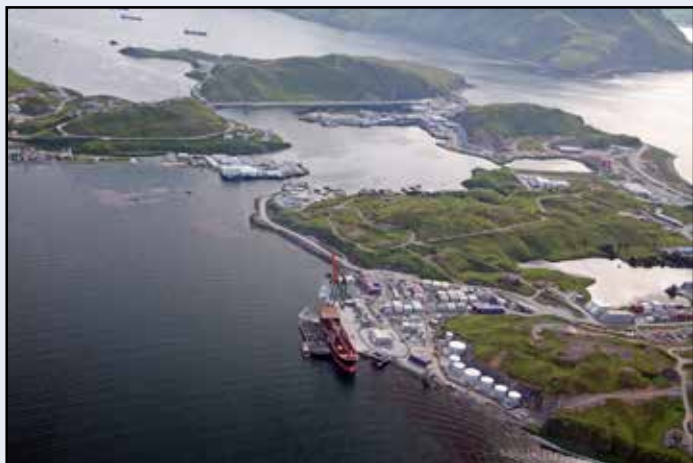
APL Dock and Iliuliuk Harbor viewed from the northwest.