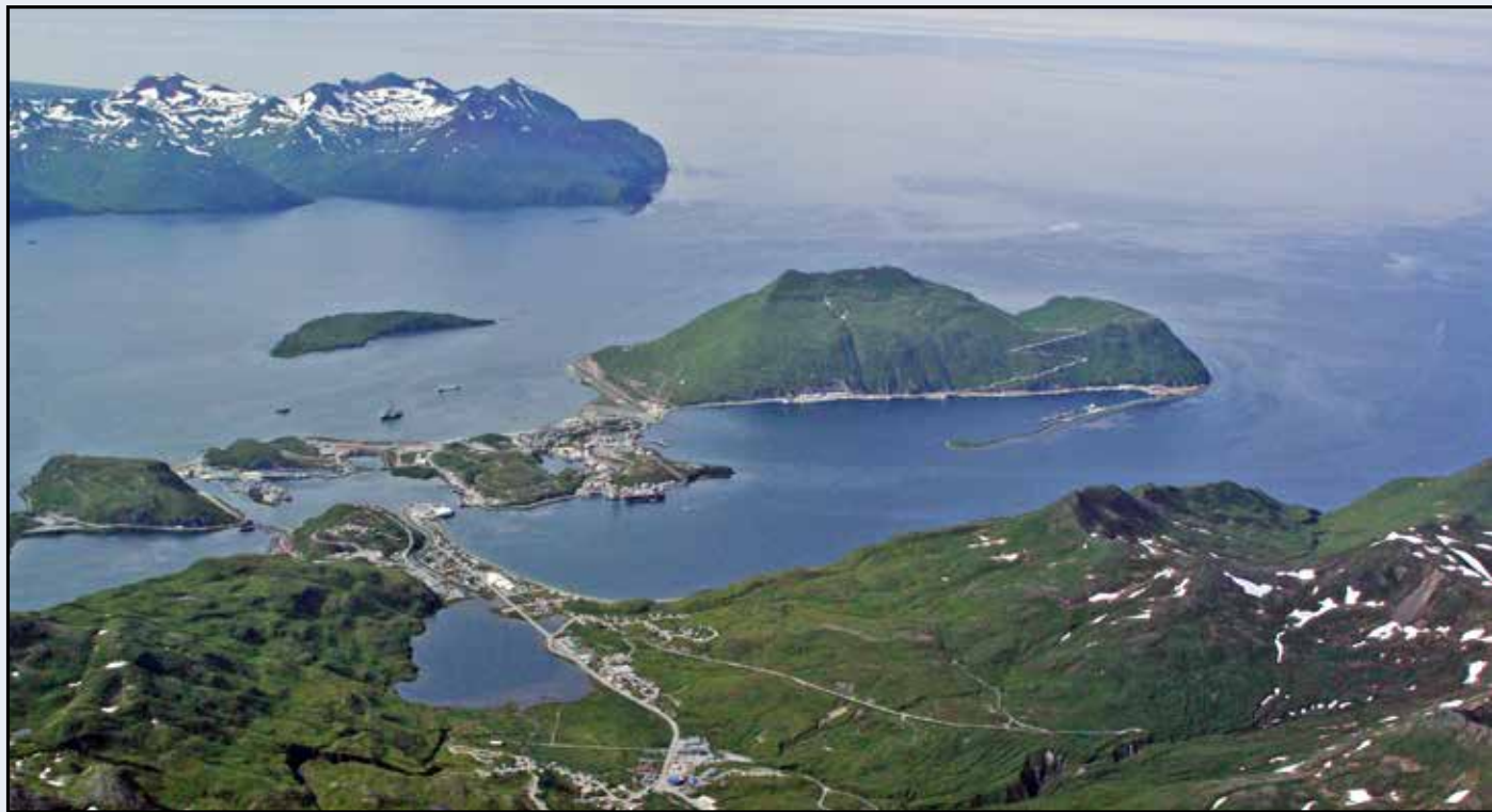
Dutch Harbor viewed from the east.