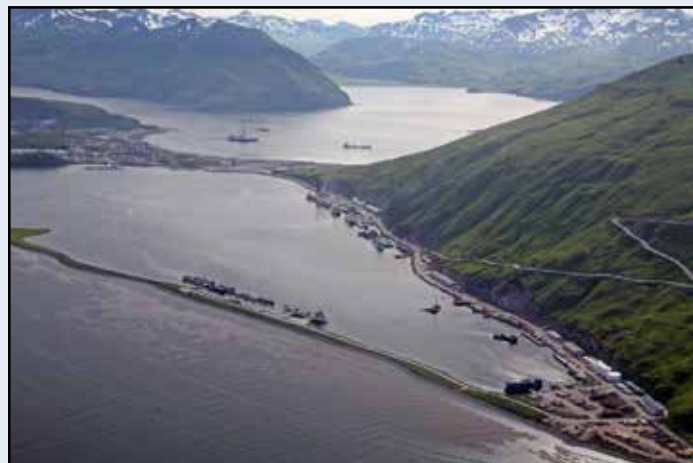
Dutch Harbor viewed from the northwest.