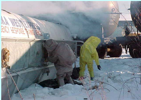
Fairbanks Hazmat Drill – Feb 22, 2003 Simulated Railcar/Truck Accident

The Statewide Hazmat Team is composed of several teams capable of deploying to any location in the State to respond to a Hazmat release. The Team is 'Level A' capable (i.e., the highest level of capability for response). The Teams are based in Anchorage, Fairbanks, Kodiak, and Valdez and are available for callout through the Alaska Department of Environmental Conservation. The teams are available for emergency response only, and not for cleanup and recovery operations. Once the emergency phase is terminated, the teams will be returned to their location of origin.