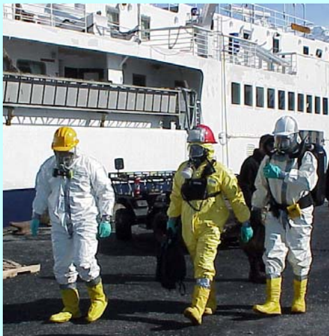
Seward Vessel Hazmat Drill – March 2004