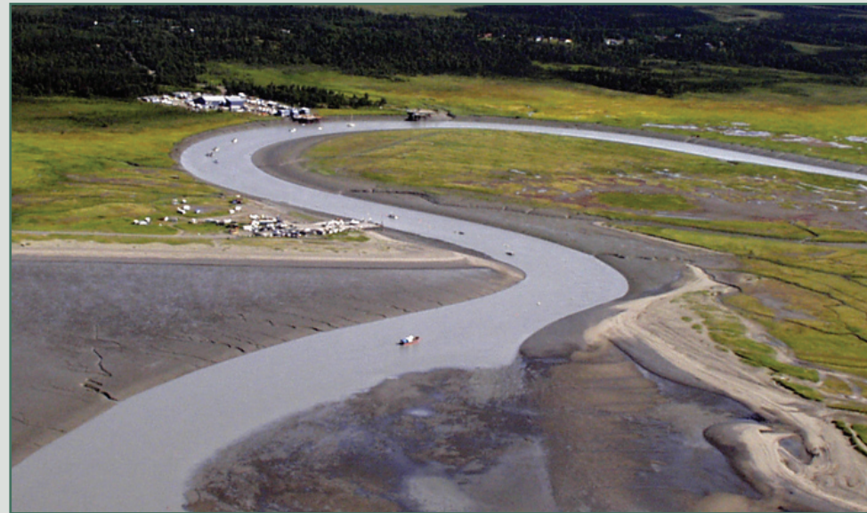
Kasilof River, CCI-06-01 as viewed from the Northwest.