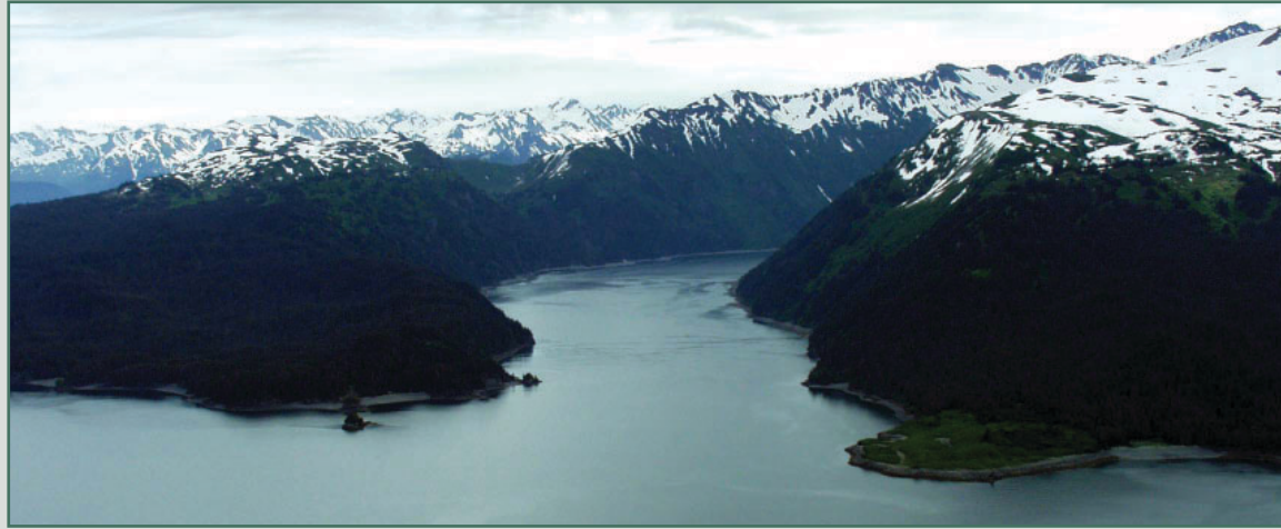
Sadie Cove, KB-07 as viewed from the West.