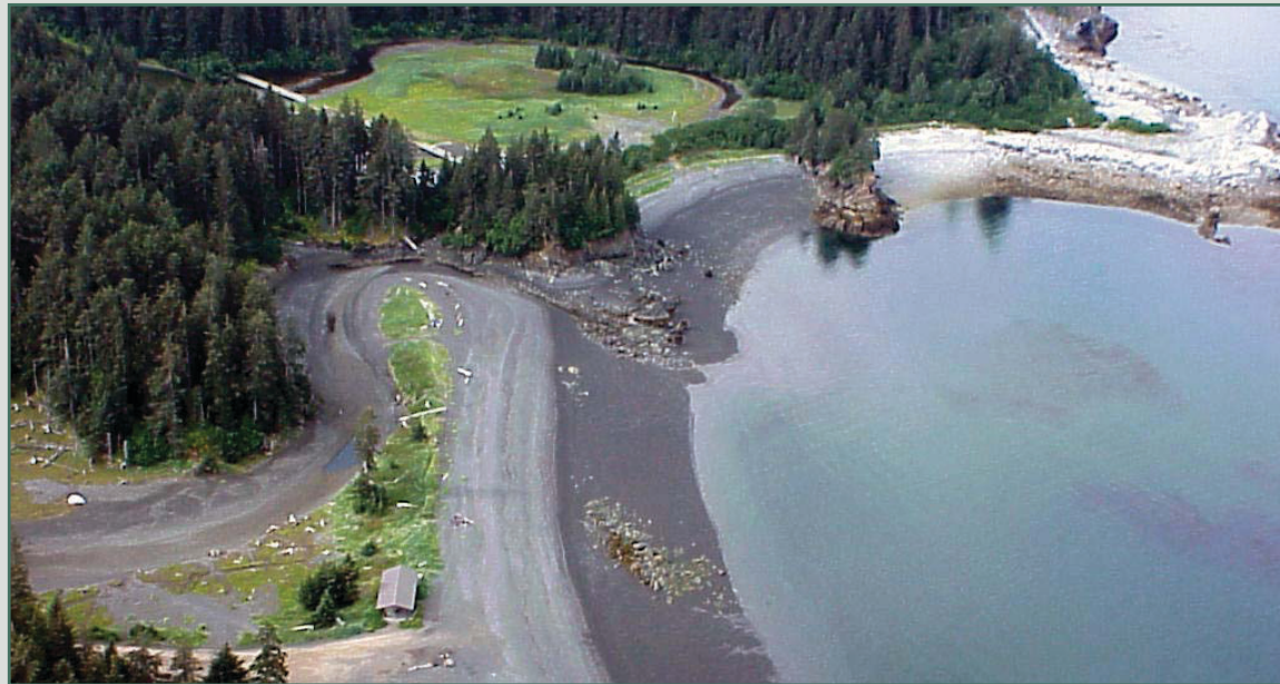
Seldovia Outside Beach, KB-14 as viewed from the North.