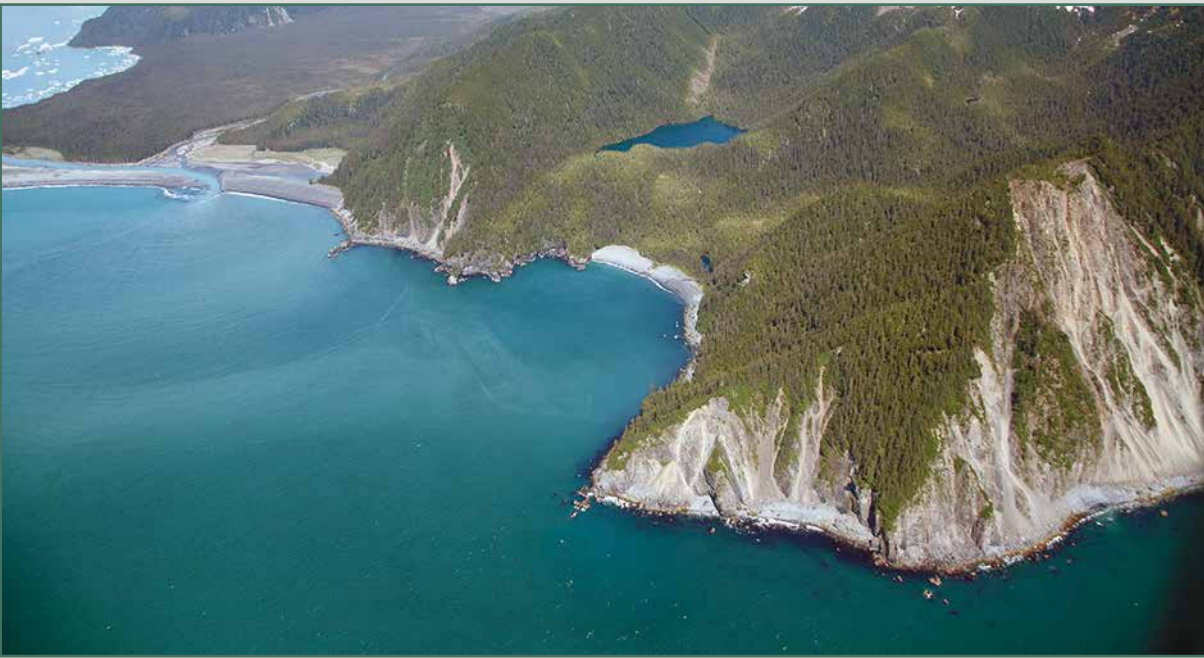
Johnstone Bay viewed from the south.