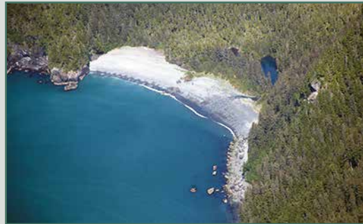
◀PR02 viewed from the west.