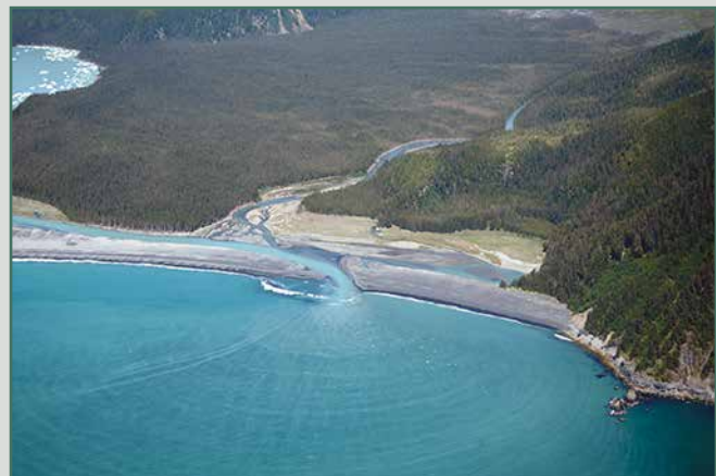
Johnstone Bay River viewed from the south.