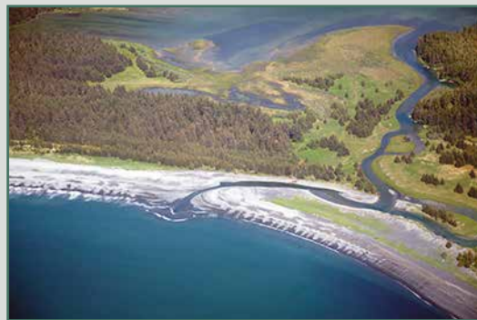
◀EX01a viewed from the west.