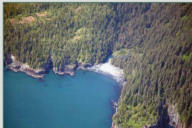
Cup Cove viewed from the southeast.