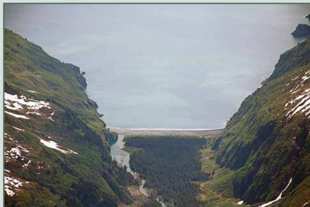
Sandy Bay viewed from the northwest.