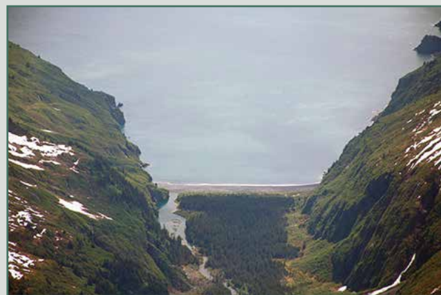
Sandy Bay viewed from the northwest.