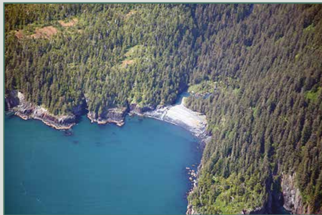
Cup Cove viewed from the southeast.