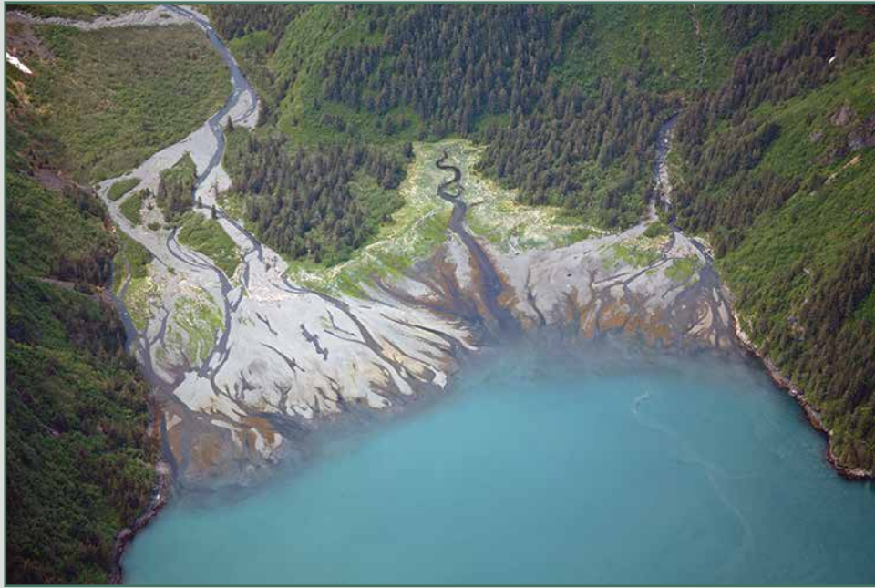
The back of the Paguna Arm.