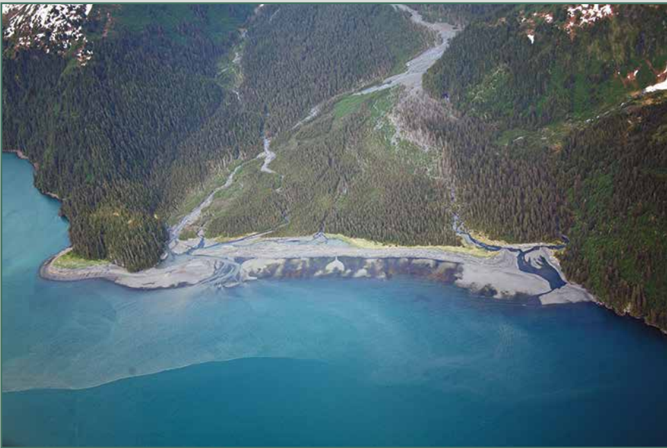
PR02a & b viewed from the southwest.