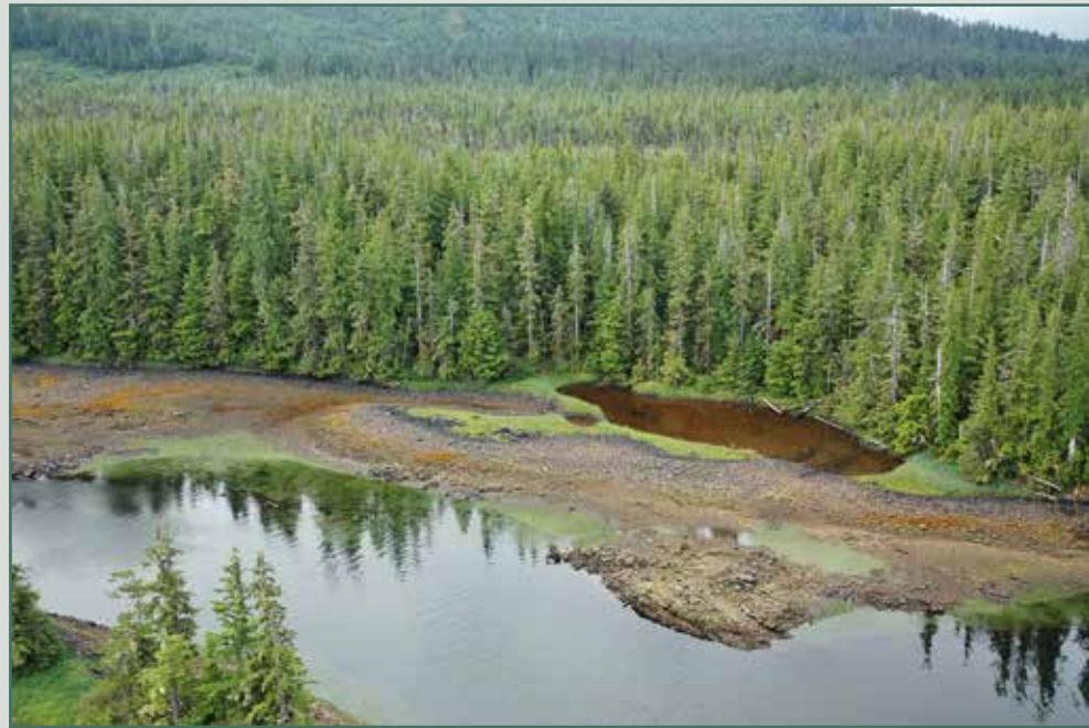
EX01a viewed from the north.

This is not intended for navigational use.