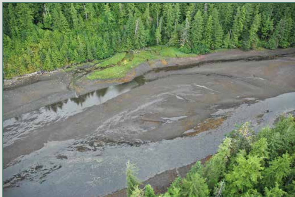
EX01e viewed from the southeast.