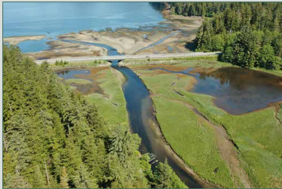
EX01a viewed from the southwest.

This is not intended for navigational use.