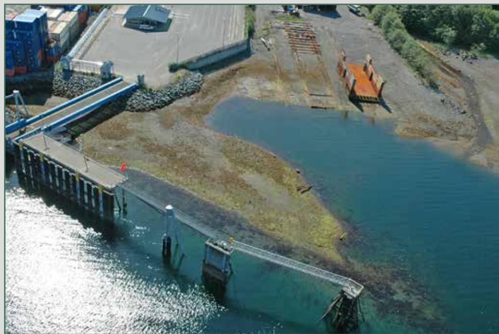
EX01b viewed from the north.