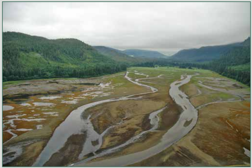
EX01f viewed from the southeast.

This is not intended for navigational use.