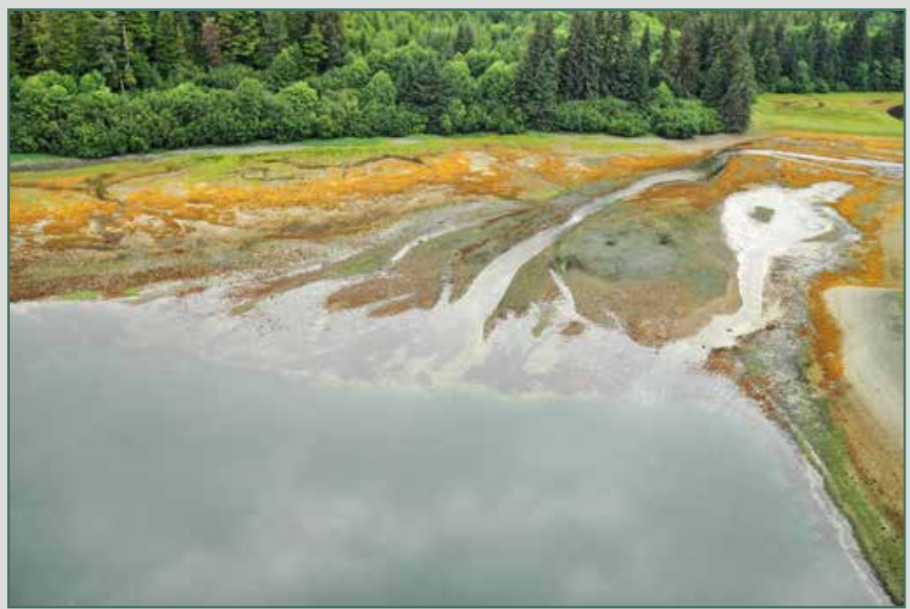
EX01d viewed from the south.