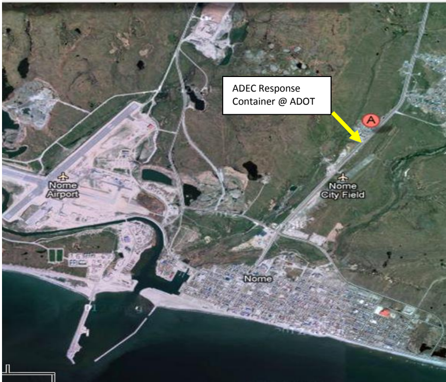
ADEC Response Container @ ADOT