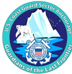
U.S. COAST GUARD SECTOR ANCHORAGE