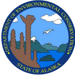
ALASKA DEPT OF ENVIRONMENTAL CONSERVATION