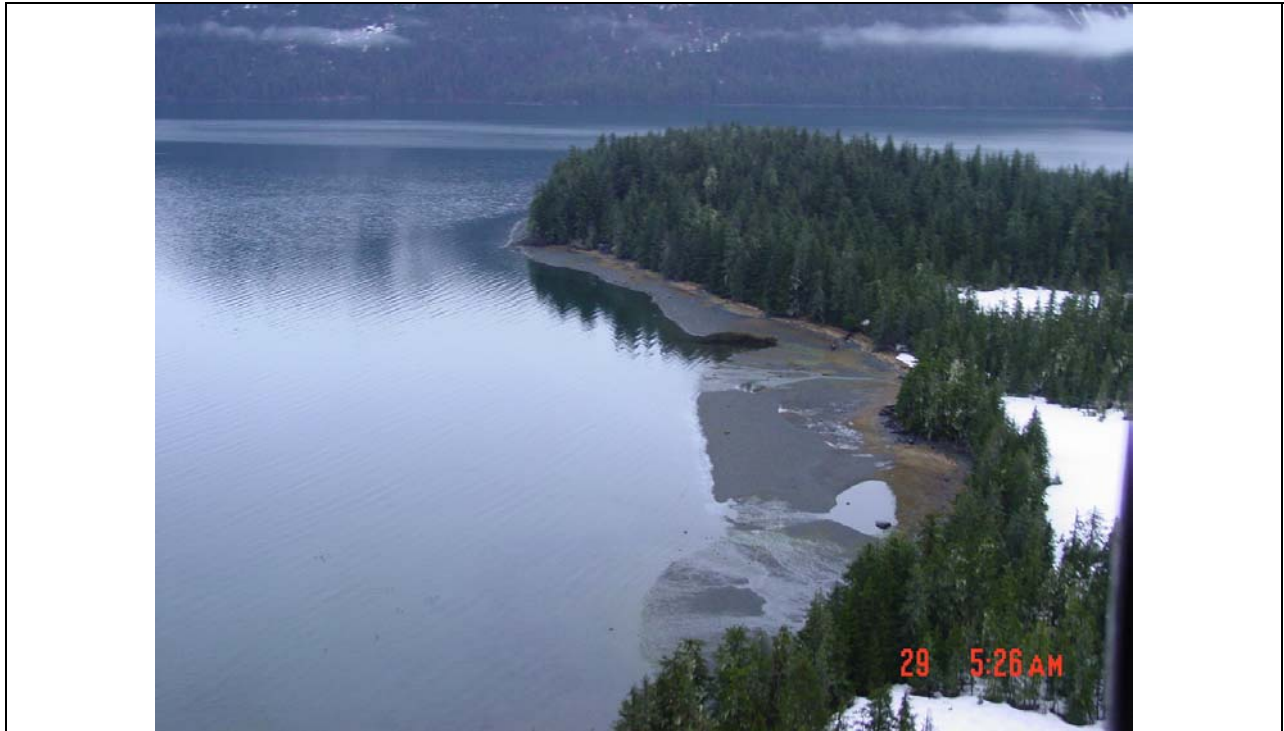
Photo of beach with light sheen along water line