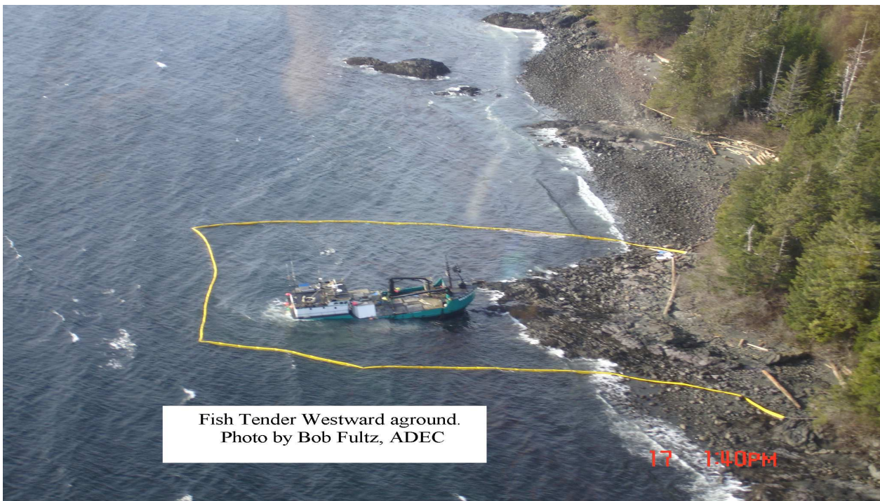
Fish Tender Westward aground.