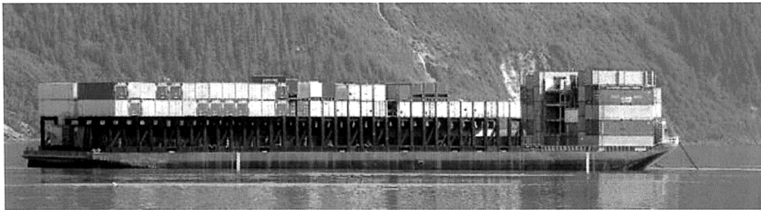
Photos of F/B Anchorage Provider and location of leaking container AMLU400501.