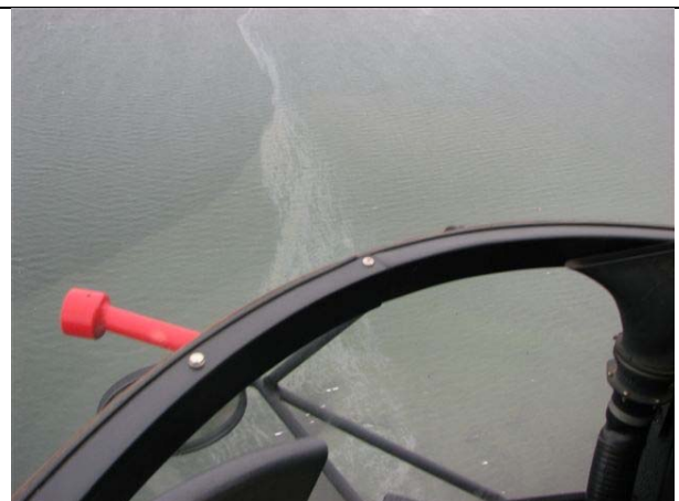
SERVS helo over flight morning 4/25