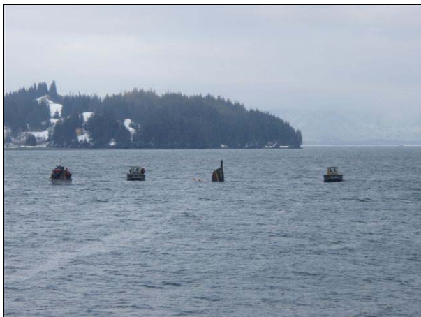
City of Seldovia going under the waves