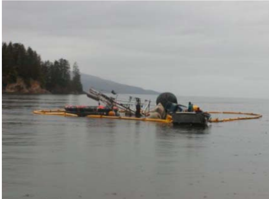
SEAL photo of the F/V Patty J taken during transit to Square Cove on September 8, 2009.