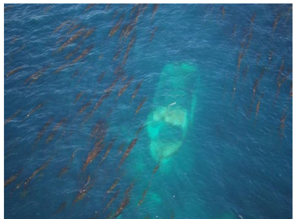
August 31, 2009