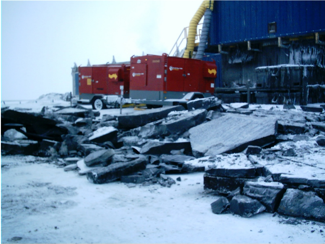
Large heaters, in red trailers, pump hot air into the drilling rig to assist in unthawing the hydraulic system. Heavy slabs of released drilling muds lay in the foreground.