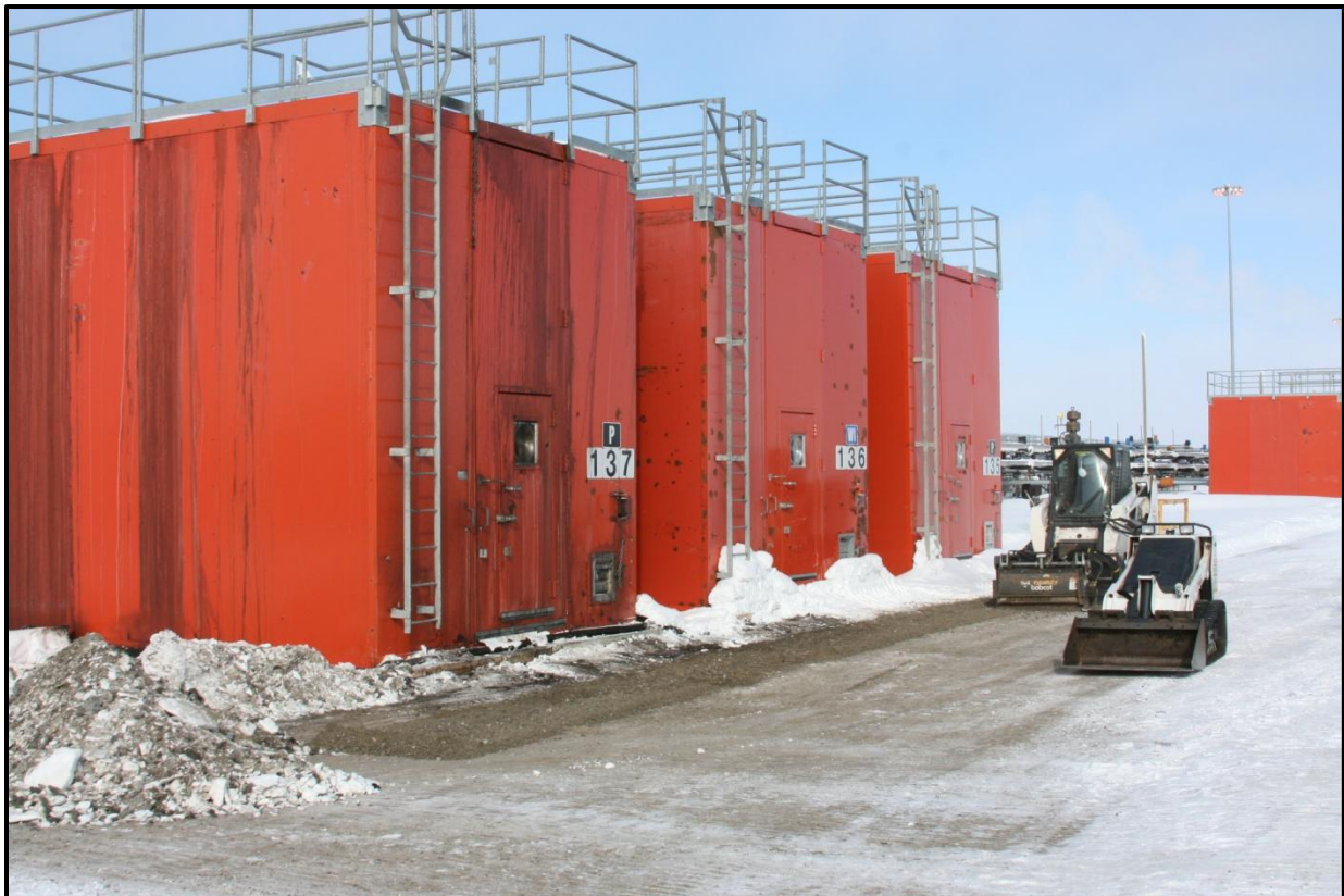
Figure 2: Snow removal in front of well house #137, drill site 1J. April 21, 2012.