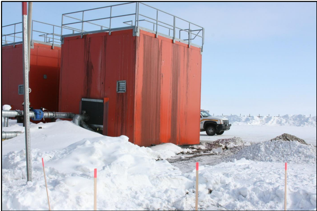
Figure 1: Picture taken behind well house #137, drill site 1J. Delineation of spill area has taken place; cause of spill is still under investigation. April 21, 2012.