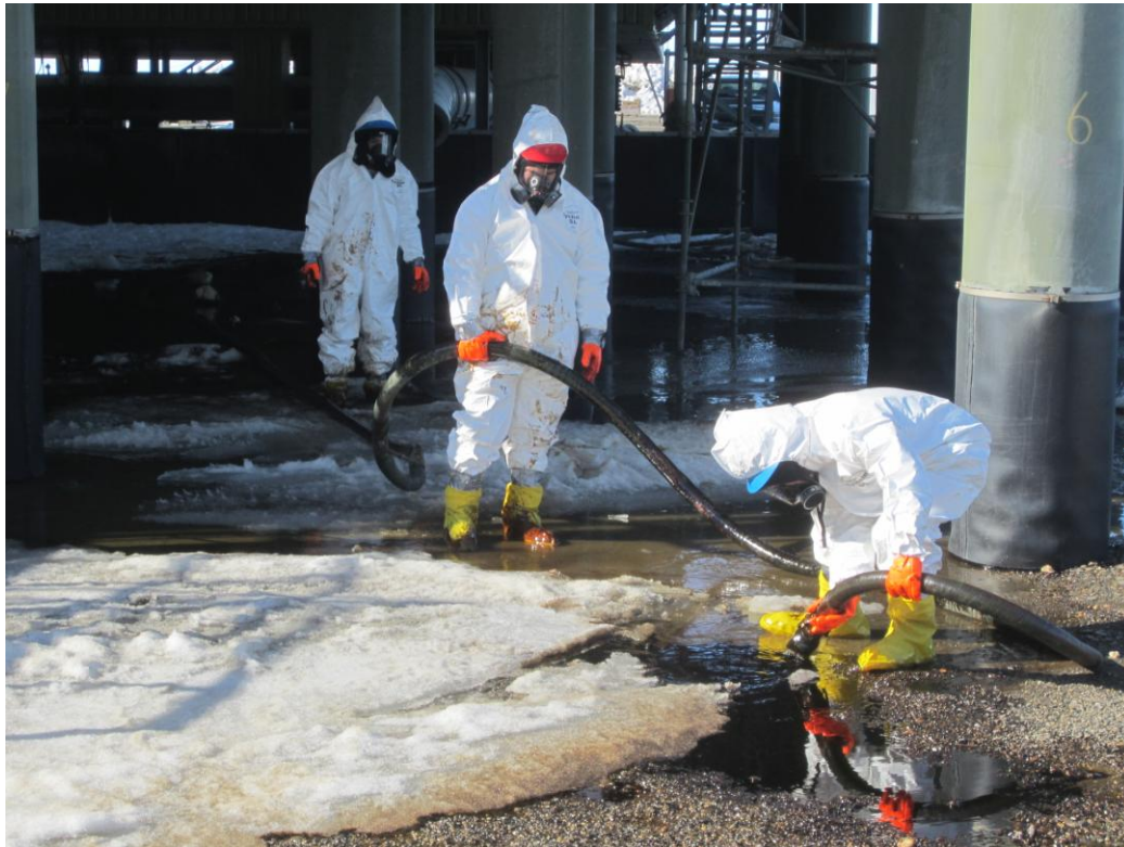
Spill response technicians using a vacuum hose to cleanup free standing crude oil and water