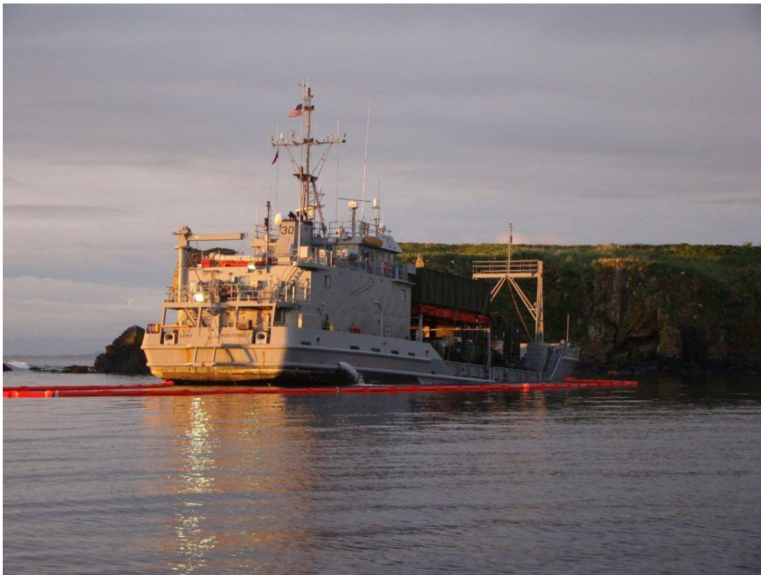
M/V Monterrey, Puffin Island, June 9, 2012