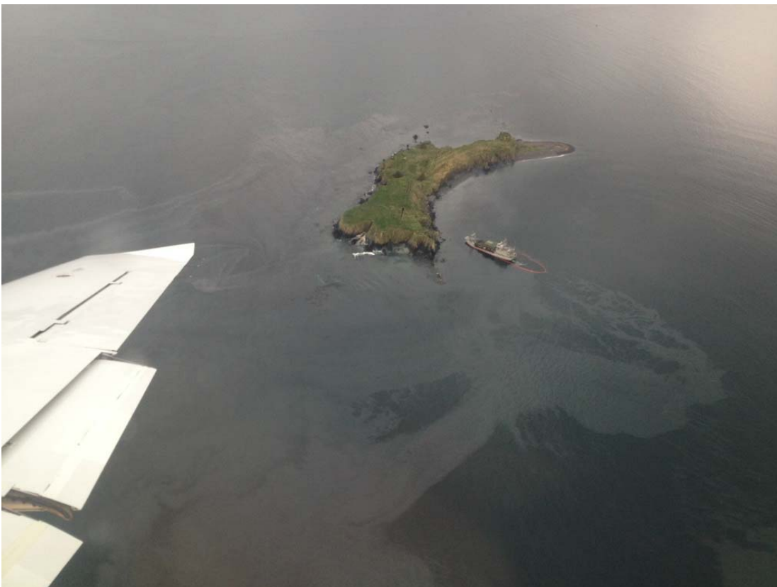
Aerial view of MV Monterrey, Puffin Island, June 9, 2012