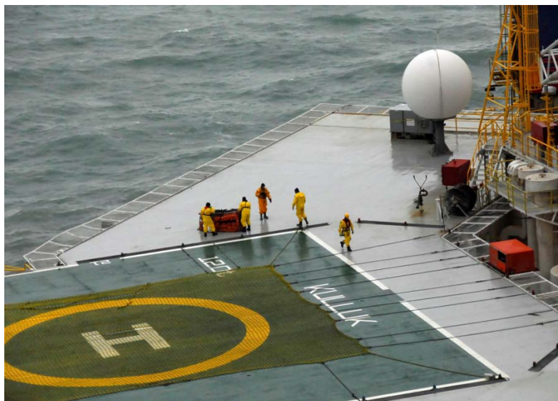
Salvage assessment team arriving on the Kulluk and inspecting the emergency towing system (photo by USCG, Jan 2)