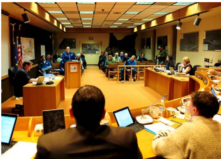
Kodiak Borough Assembly Meeting (Jan 3, 2013)