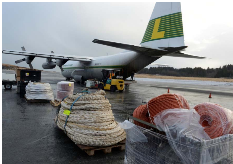
Gear being loaded onto flight to Kodiak (Photo by USCG, Jan 4, 2013)