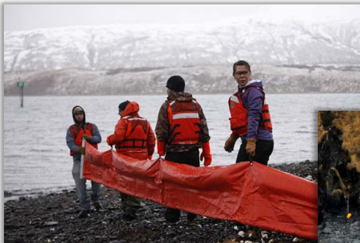
Old Harbor residents deploy boom during Hazardous Waste Operations and Emergency Response (HAZWOPER) training. The class was provided by Shell Alaska.