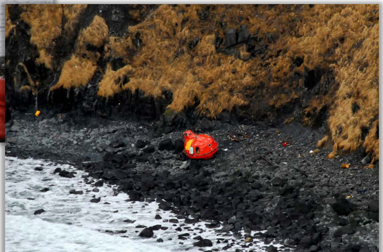
A life raft belonging to the CDU Kulluk sits on the beach near the CDU Kulluk grounding site.