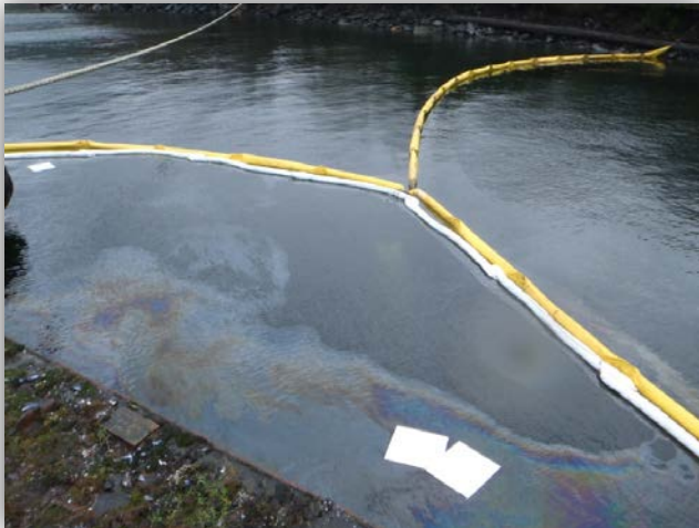
Additional boom deployed, January 16, 2014.