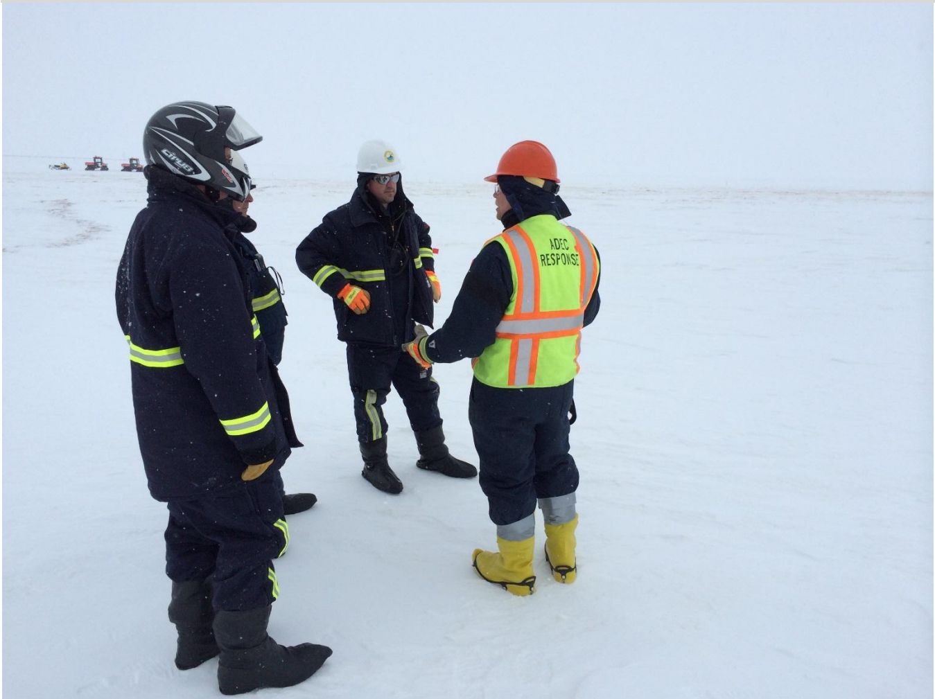
ADEC and BPXA responders discussing delineation of spill area and potential response tactics

http://dec.alaska.gov/spar/perp/response/sr_active.htm