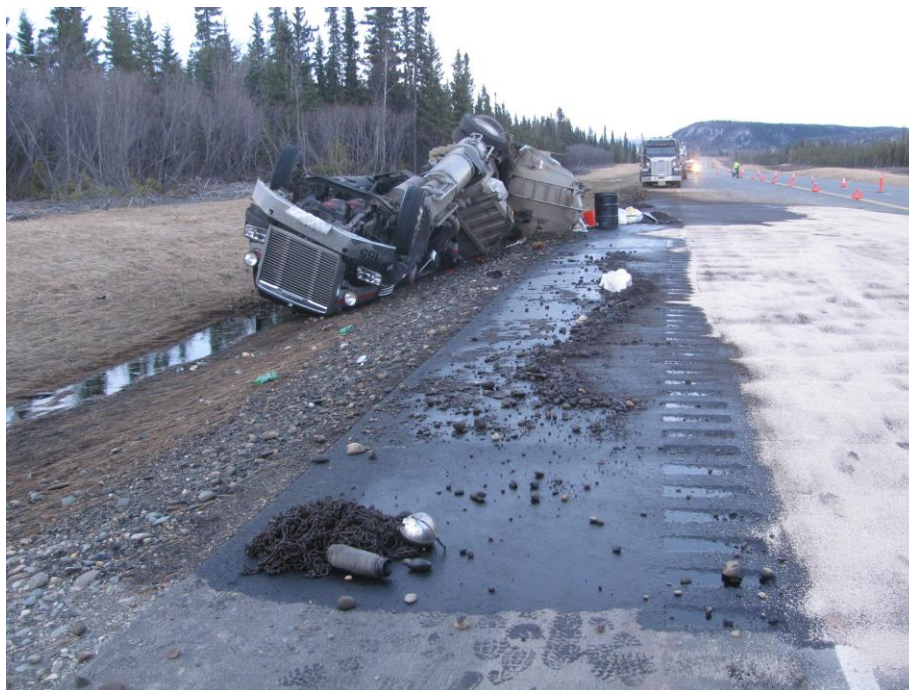
Figure 1. Tanker trailer rolled over along the roadway. Unaffected pup trailer not visible.