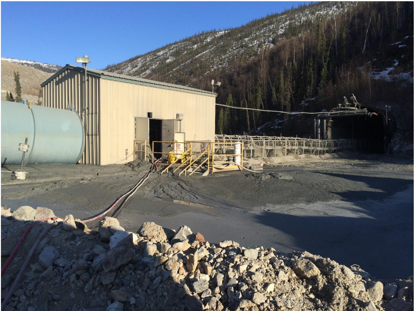
Figure 2. Backfill paste released inside and outside containment by 1690 portal module