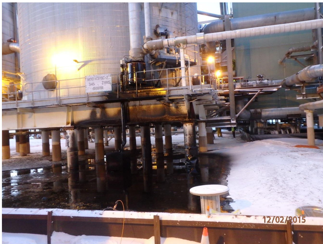
Tank 7703, some released product visible underneath the elevated tank