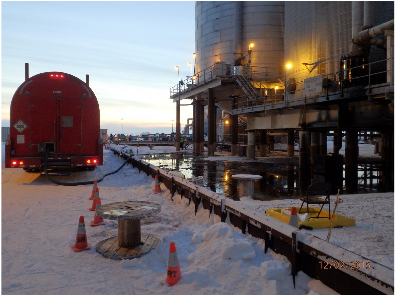
Photo of spill site, with vacuum truck utilized for product recovery depicted

FOR ADDITIONAL INFORMATION CONTACT: Candice Bressler, PIO, ADEC (907) 465-5009 Tom DeRuyter, ADEC (907) 451-2145 dec.alaska.gov/spar/perp/response/sr_active.htm