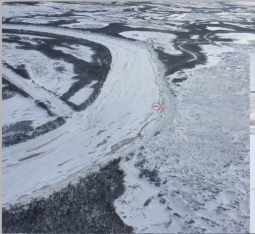
Caterpillar EL180 in Qinaq River near Tuntutuliak, Alaska