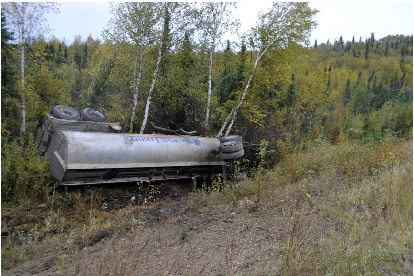
Fuel had finished being offloaded from the secondary tank and actions to bring the tank to the roadway were just about to begin, September 5, 2016.

AGENCY/STAKEHOLDER NOTIFICATION LIST: This situation report was distributed to the agencies listed on the standard distribution list, which includes the governor’s office, Senator Sullivan’s and Murkowski’s office, State Emergency Operations Center, U.S. Department of the Interior, National Marine Fisheries Service, U.S. Fish and Wildlife Service, and other state agencies. This situation report was also distributed to the following agencies and stakeholders: