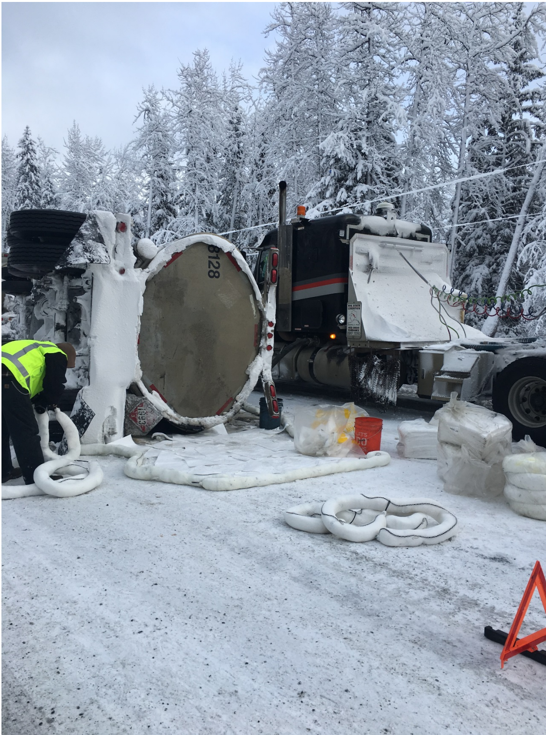
Figure 4. Big State Logistics personnel responding to the spill.

AGENCY/STAKEHOLDER NOTIFICATION LIST: This situation report was distributed to the agencies listed on the standard distribution list, which includes the governor’s office, State Emergency Operations Center, U.S.