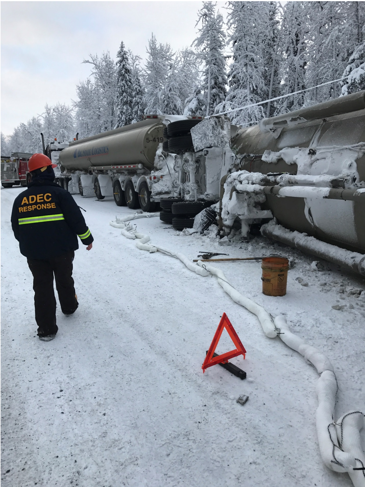
Figure 2. Boom around compromised secondary tank.