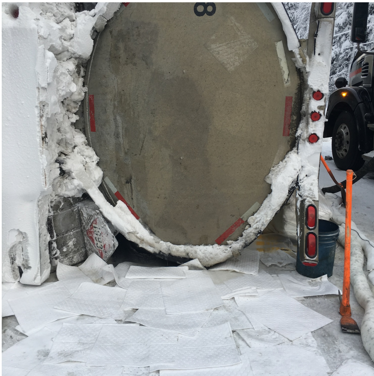
Figure 3. Sorbents around the compromised secondary tank.