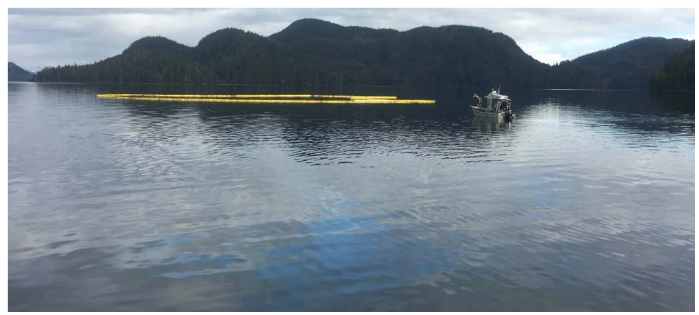
Booming of Tug Powhatan

AGENCY/STAKEHOLDER NOTIFICATION LIST: This situation report was distributed to the agencies listed on the standard distribution list, which includes the governor's office, State Emergency Operations Center, U.S. Department of the Interior, National Marine Fisheries Service, U.S. Fish and Wildlife Service, and other state agencies. This situation report was also distributed to the following agencies and stakeholders: