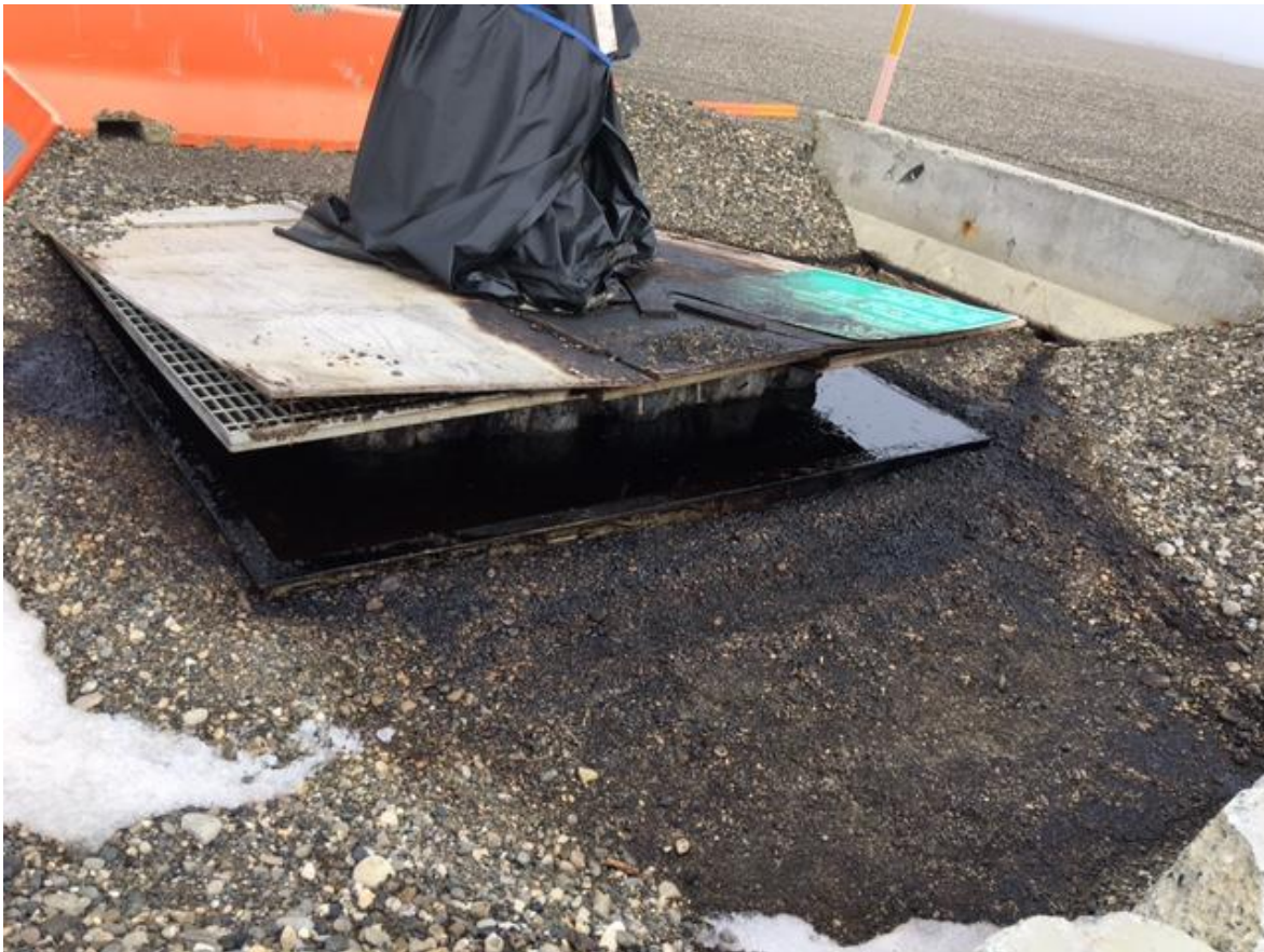
Image taken on June 17, 2017, showing Nuna Well NDST-2 well cellar and adjacent pad gravels stained by freeze protect fluid.

http://dec.alaska.gov/spar/ppr/response/sr_active.htm