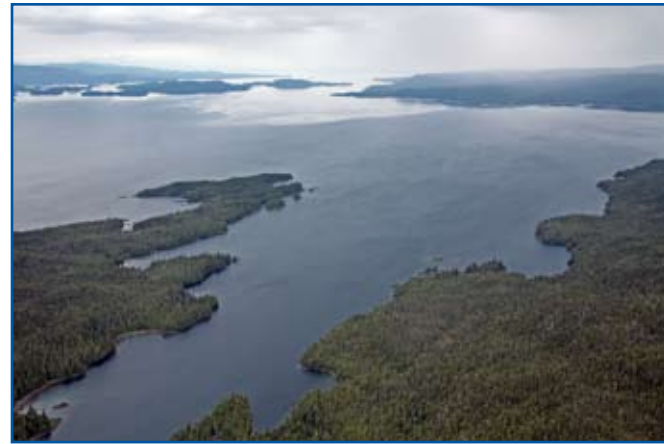
Steamer Bay viewed from the south.