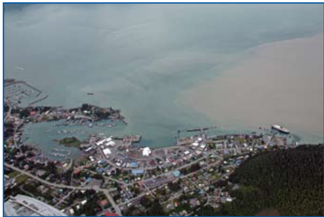
Wrangell Cruiseship Wharf, Ferry Dock and Woronkofski Anchorage viewed from the east.