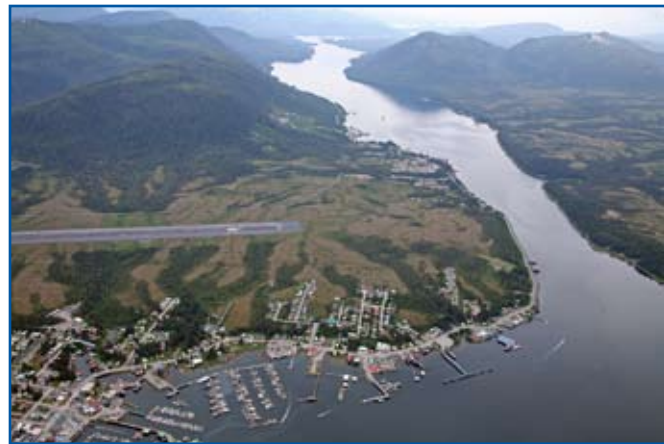
Petersburg Ferry Terminal and Scow Bay Anchorage viewed from the north.