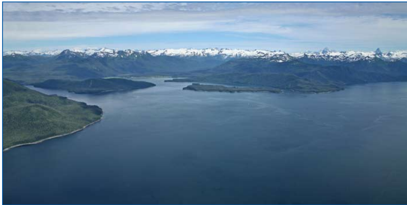
Entrance to Farragut Bay, L-03-10, viewed from the northwest.