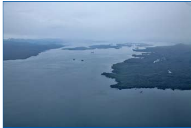
L-03-03, anchorage area near Salmon Bay viewed from the north.