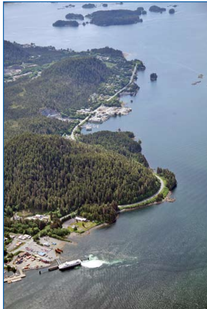
Sitka Ferry Terminal and Samson Tug Dock viewed from the northeast.