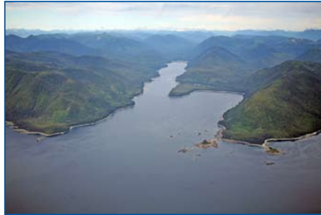
L-05-09-Florence Bay viewed from southeast.