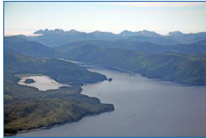
L-05-10 Point Elizabeth Anchorage viewed from the northeast.