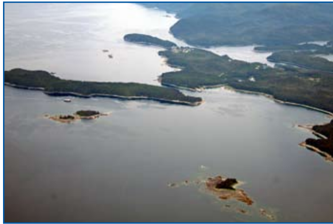
Angoon Ferry Terminal viewed from the south.