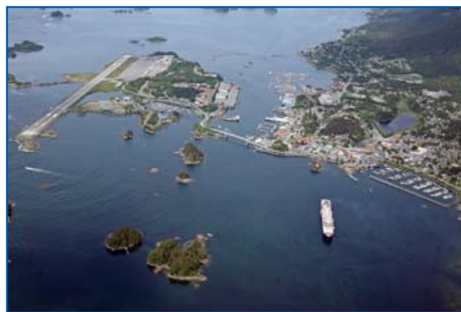
The East Anchorage and Sitka Harbor viewed from the southeast.