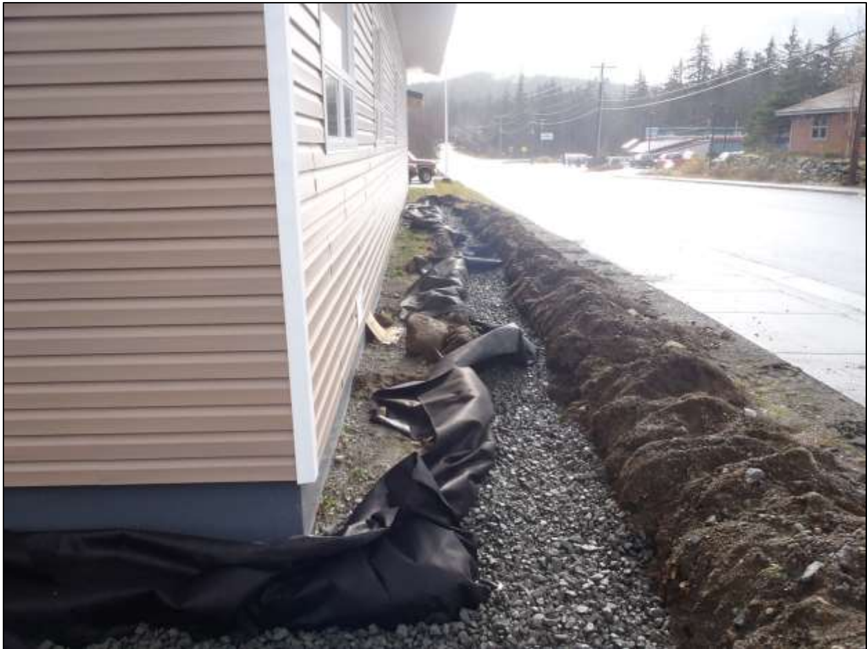
1: Rain garden at the CIA building during construction

During FY16 the Takshanuk Watershed Council (TWC) and the Alaska Department of Environmental Conservation (ADEC) partnered to develop and install two (2) Low Impact Development (LID) projects in the Sawmill Creek drainage in Haines, Alaska. The LID projects included the installation of a bioswale at the corner of 6 th and Dalton St. in Haines where snow is stored during winter plowing. Untreated, the runoff from the snow storage pile flows directly into Sawmill Creek. With the installation of the bioswale, the runoff is now filtered before entering Sawmill Creek. The other LID project was the installation of a rain garden at the Chilkoot Indian Association's building on 3 rd Ave in Haines. The rain garden treats runoff from the building roof and adjacent gravel parking lot and direct excess flow to the nearby wetland rather than the storm drain which drains to Sawmill Creek.