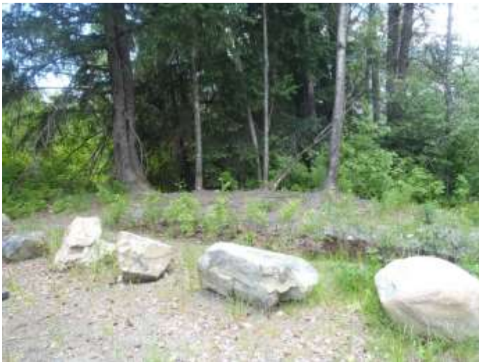
6: bioswale after planting