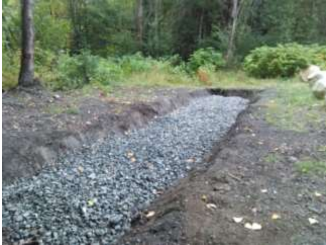
5: Bioswale during construction