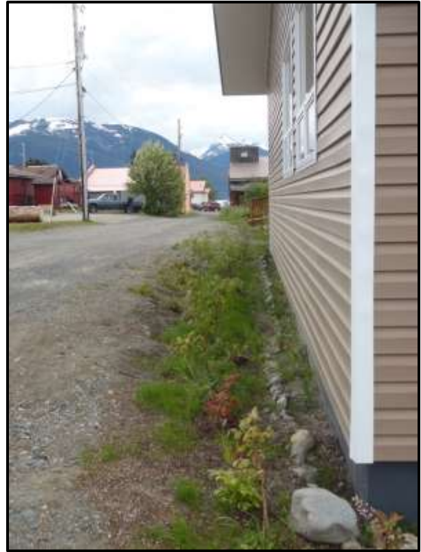
4: Before and after north/east facing side of the CIA rain garden