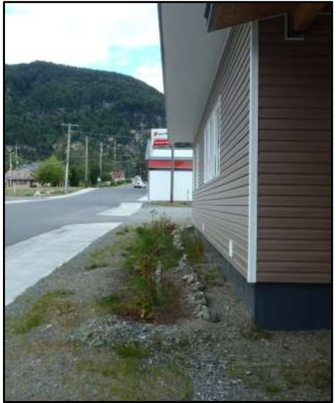
3: Before and after west facing side of the CIA rain garden