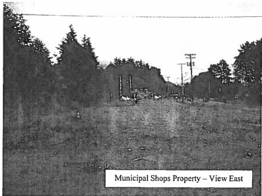
Municipal Shops Property – View East

I conducted a final site inspection with CBS employee Mark Buggins on August 1, 2007. All structures have been